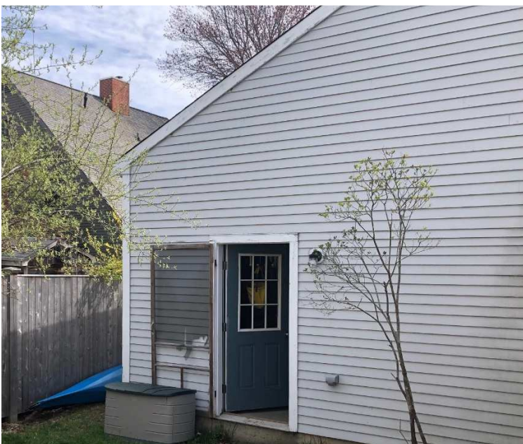
Opposite side of Garage, viewed from backyard. This door to be replaced by a pair of French doors.