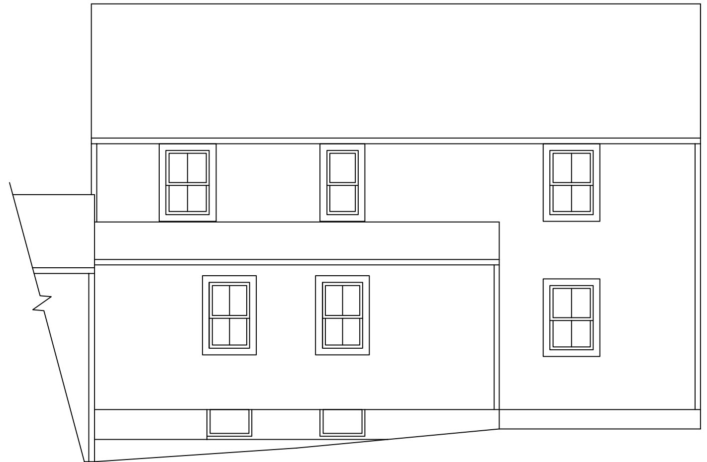
EXISTING COURTYARD ELEVATION