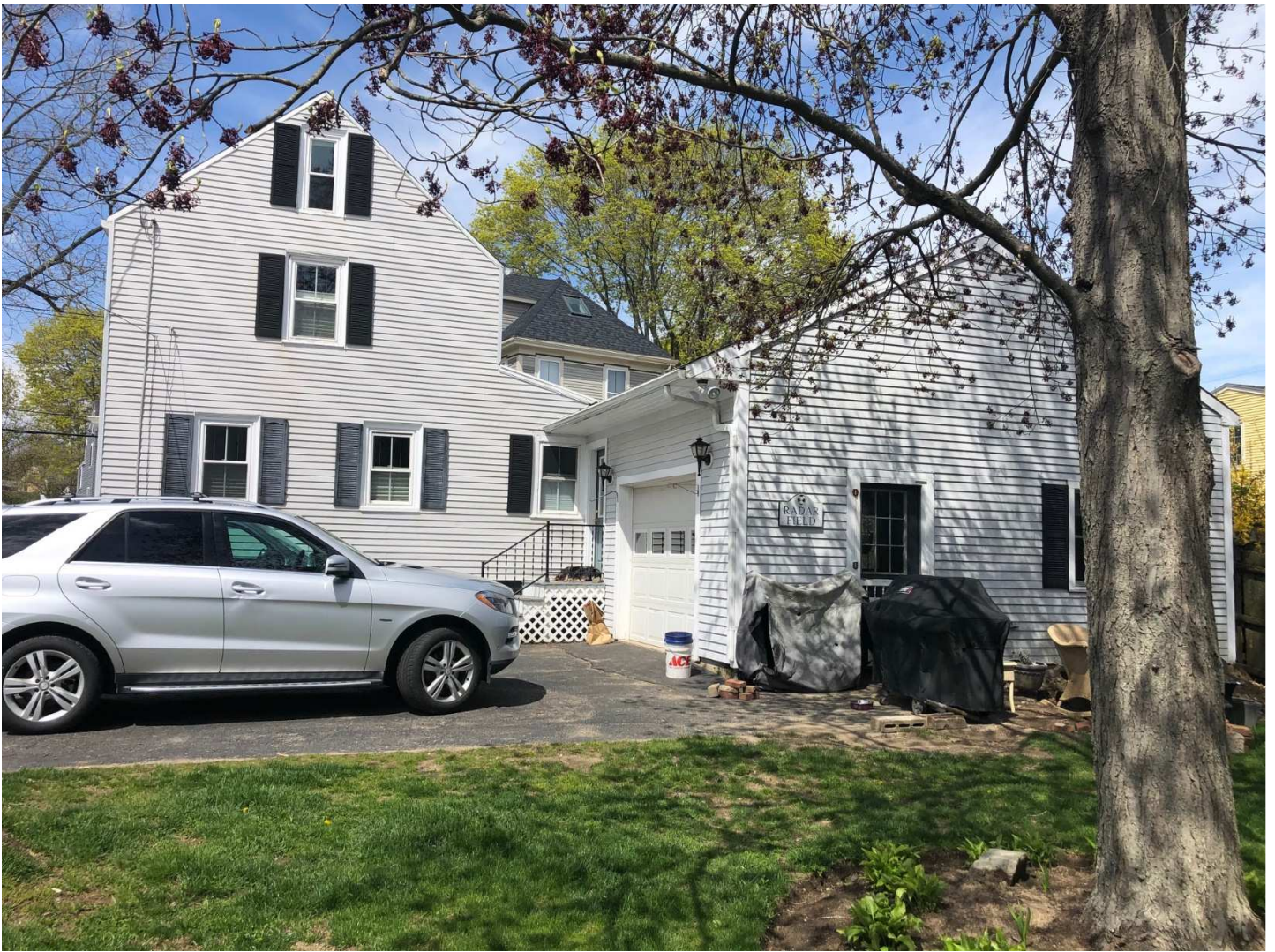
View of Garage

17 Pray Street and elevations to be renovated.