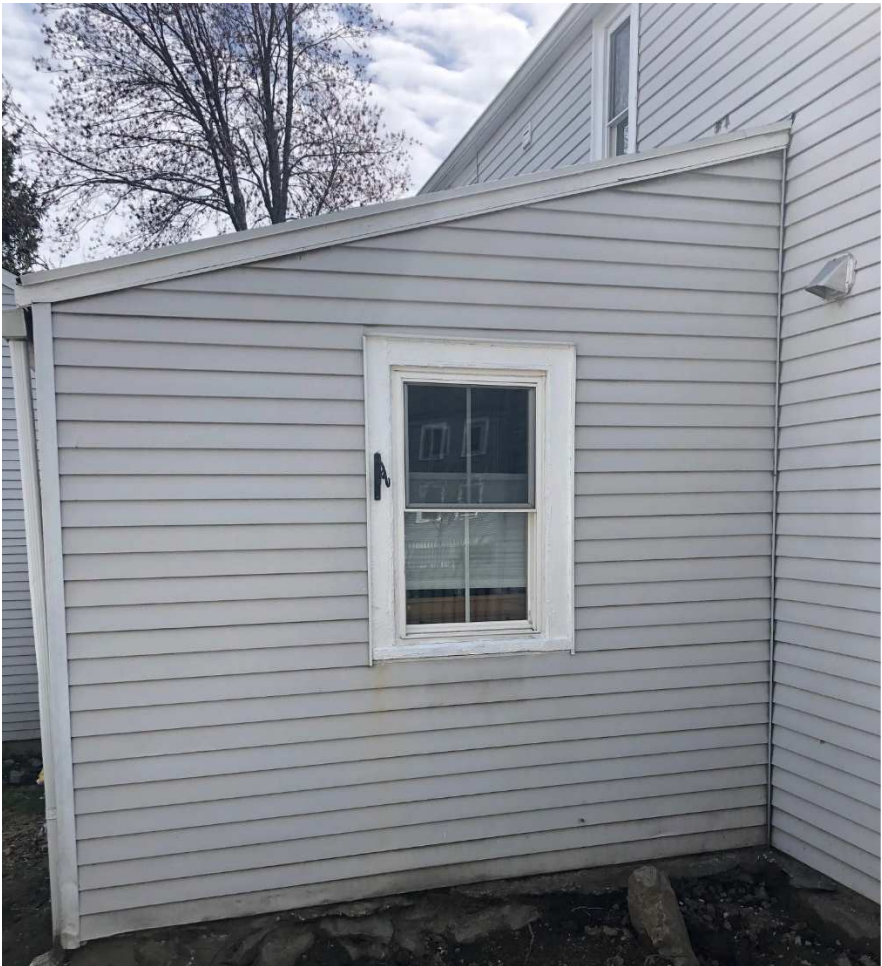
View of shed addition and third window to be replaced by a new window.