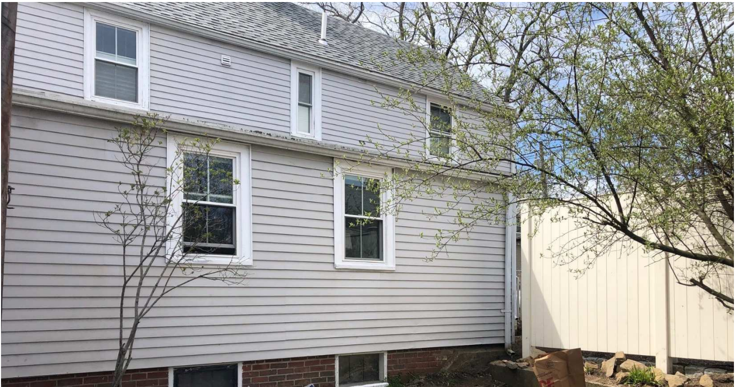
Shed addition at rear of home, viewed from back yard. These (2) first floor windows, plus (1) around the corner (see picture below) will be replaced by (4) new windows.