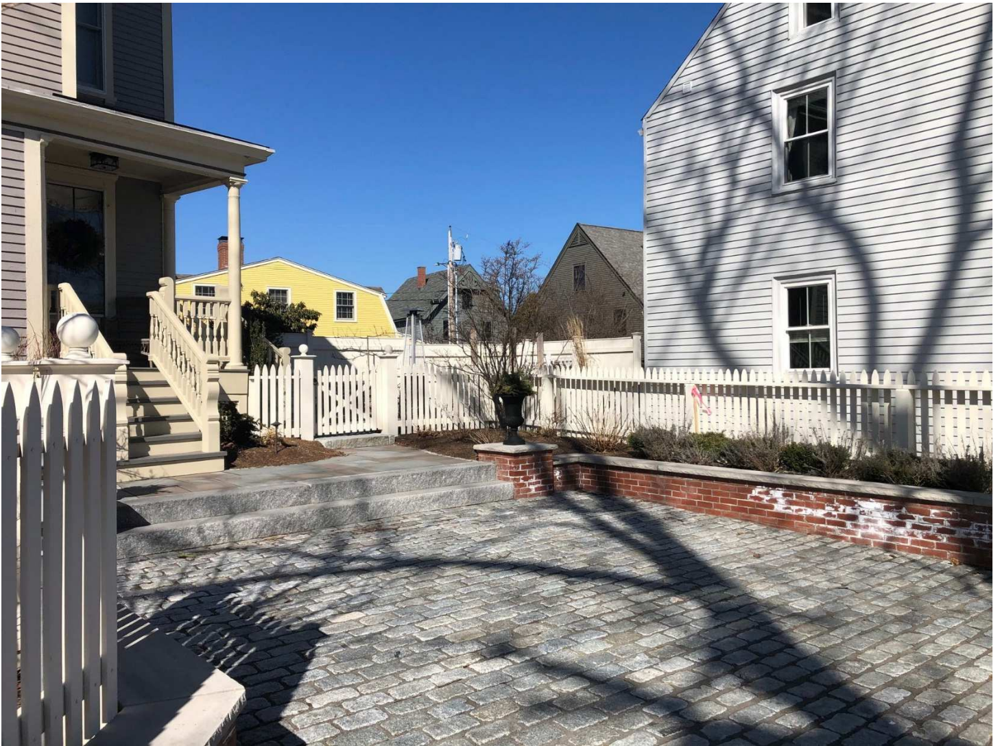
View of neighboring driveway and fencing.

All fencing separating the 2 yards was recently approved by the HDC to be taller and solid to provide both yards more privacy.