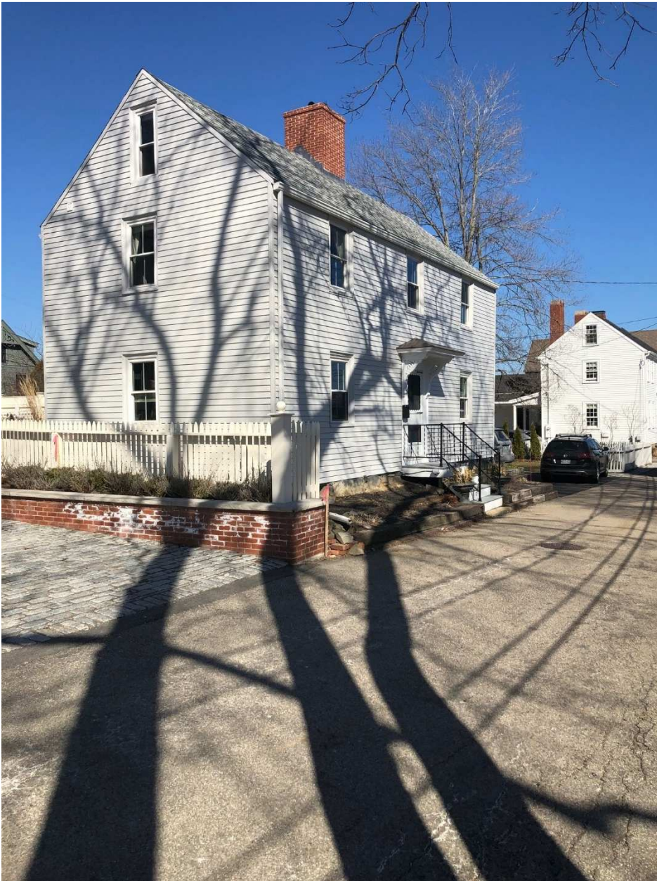
View of home from Pray Street

This application is to replace windows and doors at the rear of the home to facilitate a Kitchen renovation as well as provide access to the yard.