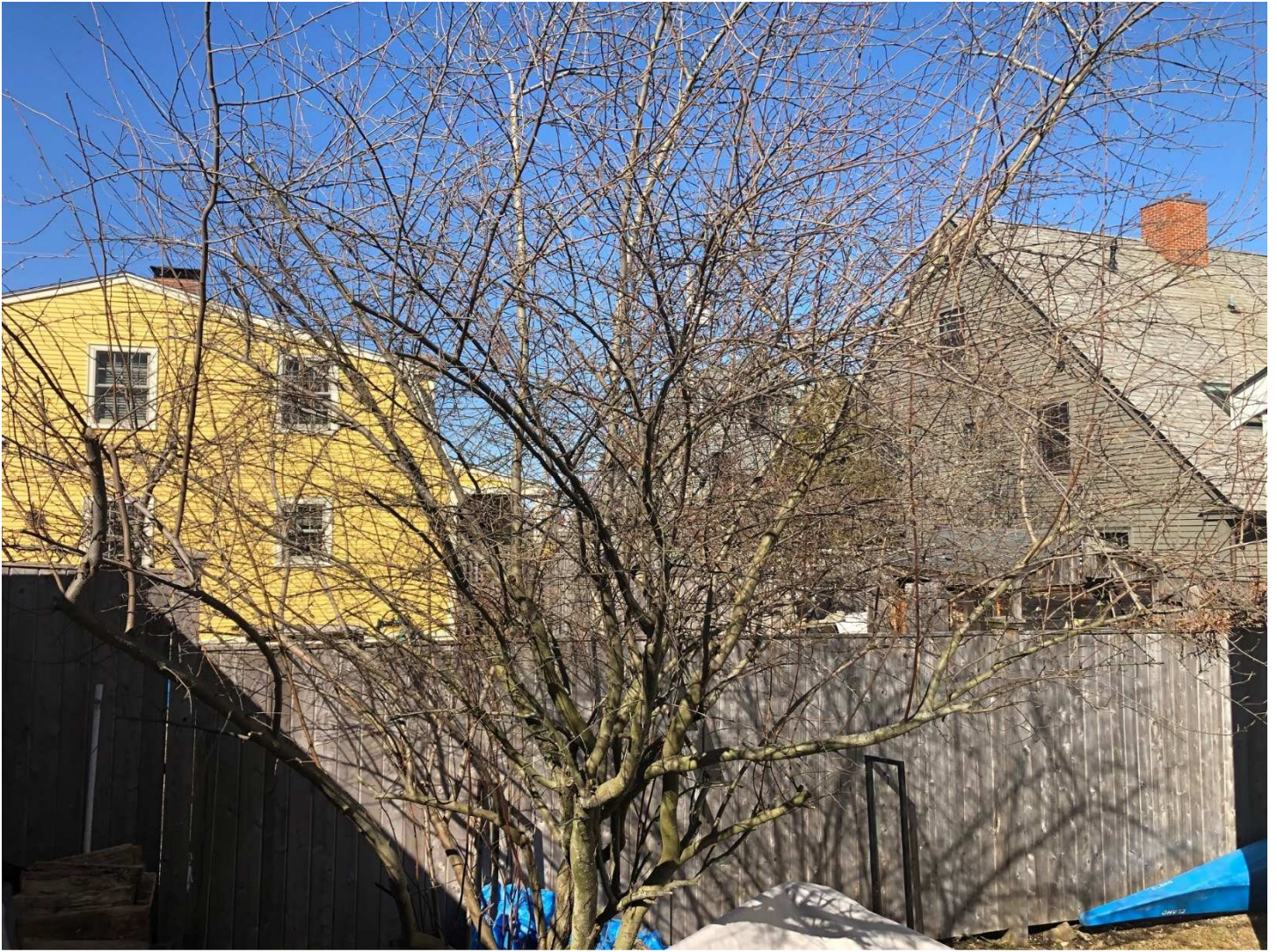
View from 17 Pray Street backyard looking toward neighboring properties.