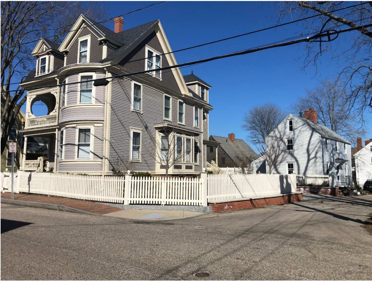
View from Pleasant Street