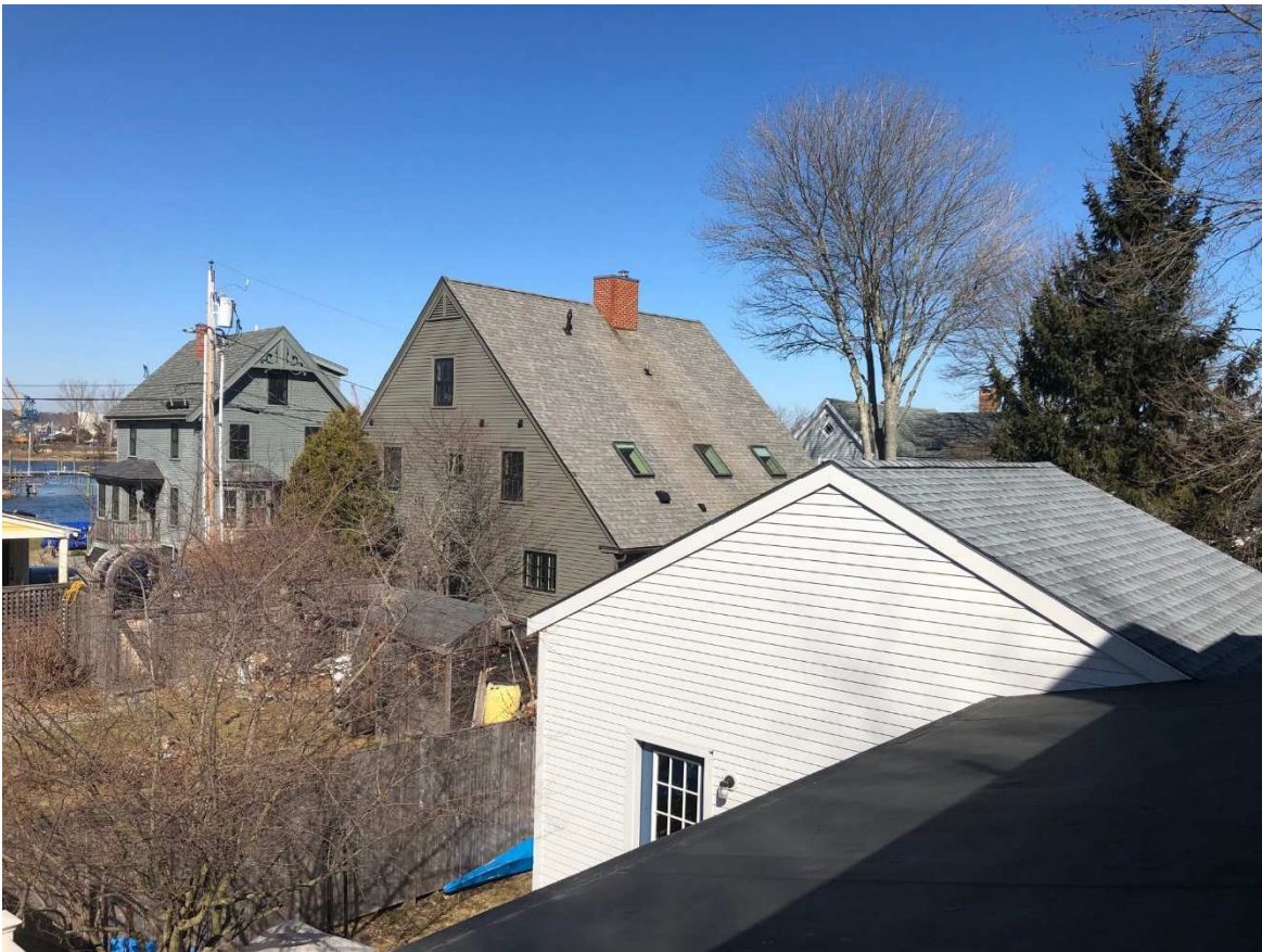
The next 2 photos have been taken from Salter Street showing the views of 17 Pray Street between neighboring homes.