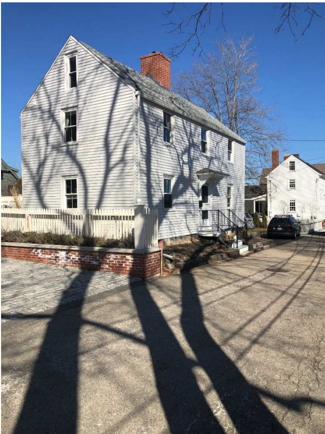
View from Pray Street