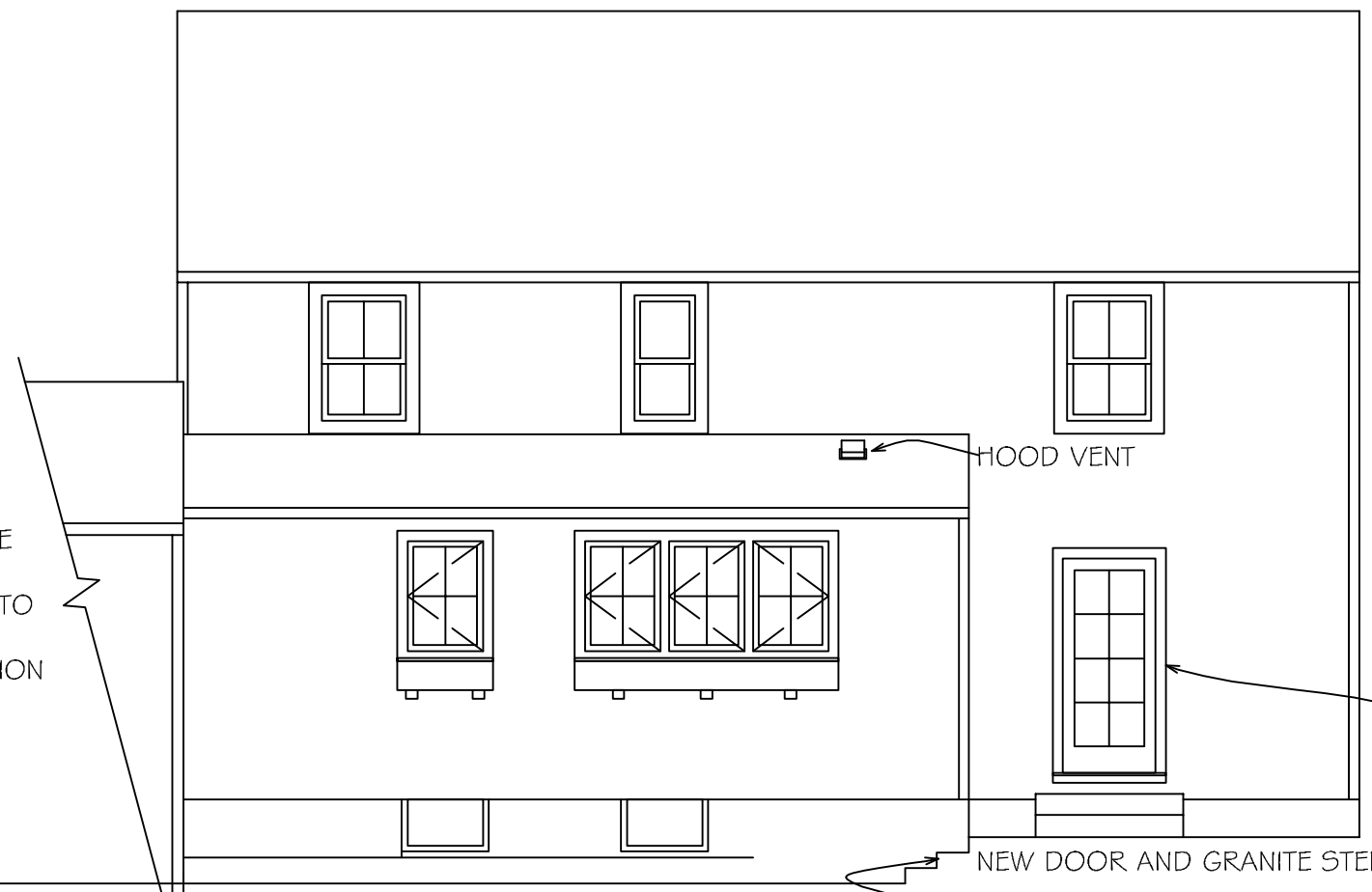
PROPOSED COURTYARD ELEVATION

INCREASE WINDOW HEADER TO 6'-8" IN ADDITION