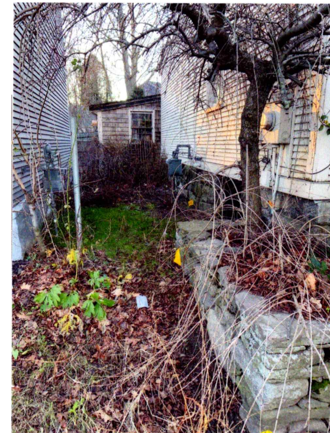
VIEW OF LEFT SIDE YARD