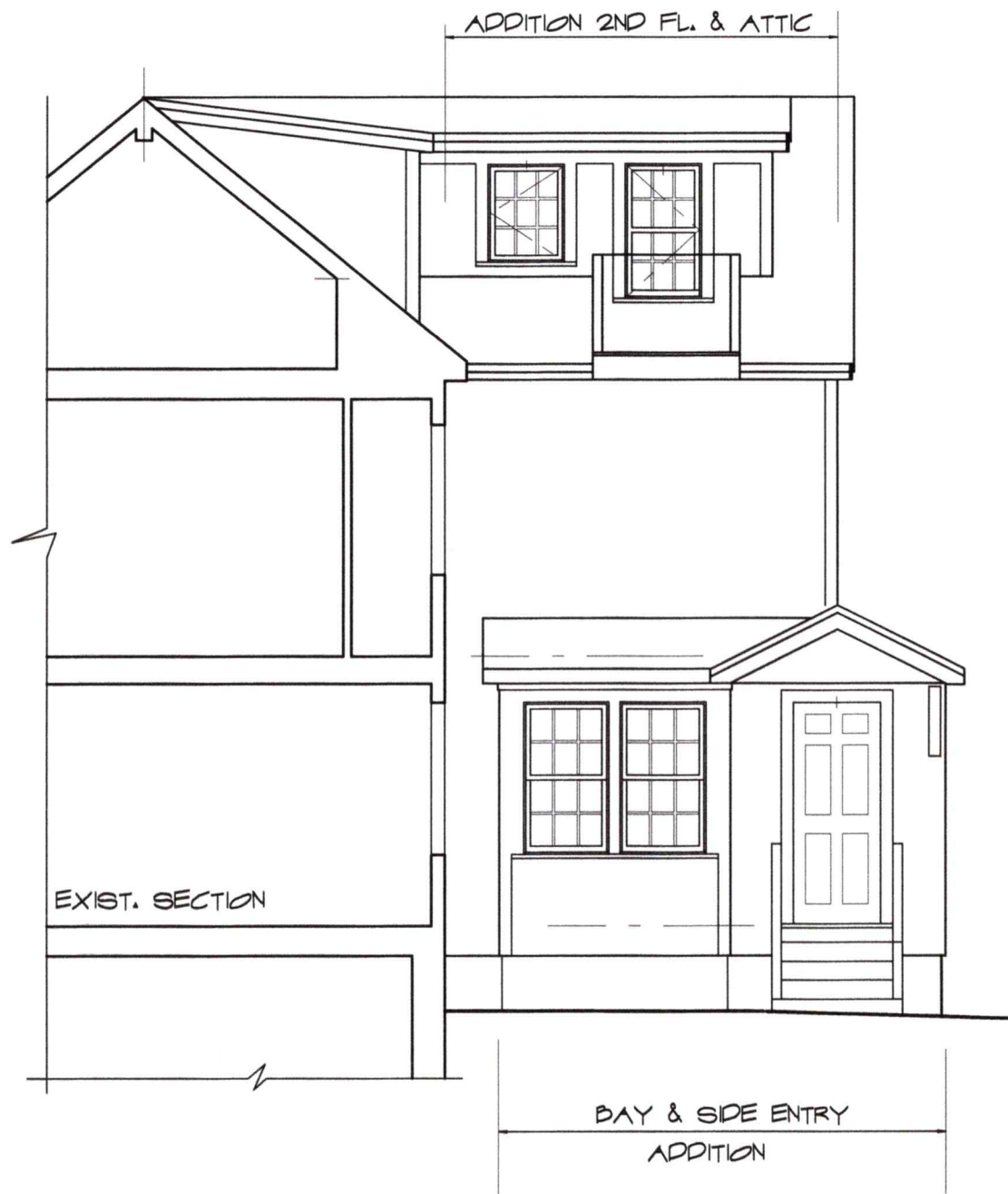
RIGHT SIDE ELEVATION SCALE: 3/16" = 1'-0"