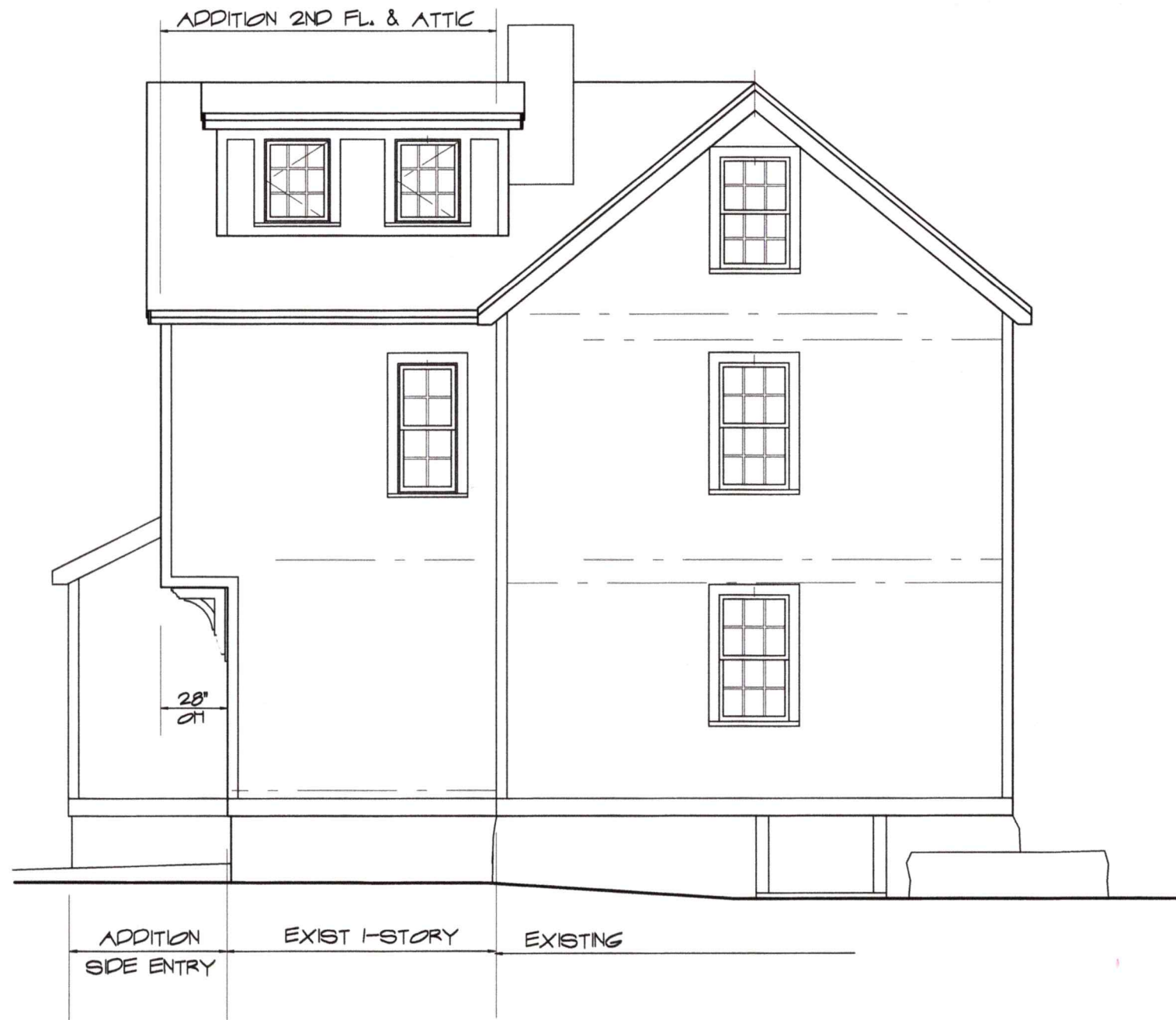
LEFT SIDE ELEVATION SCALE: 3/16" = 1'-0"