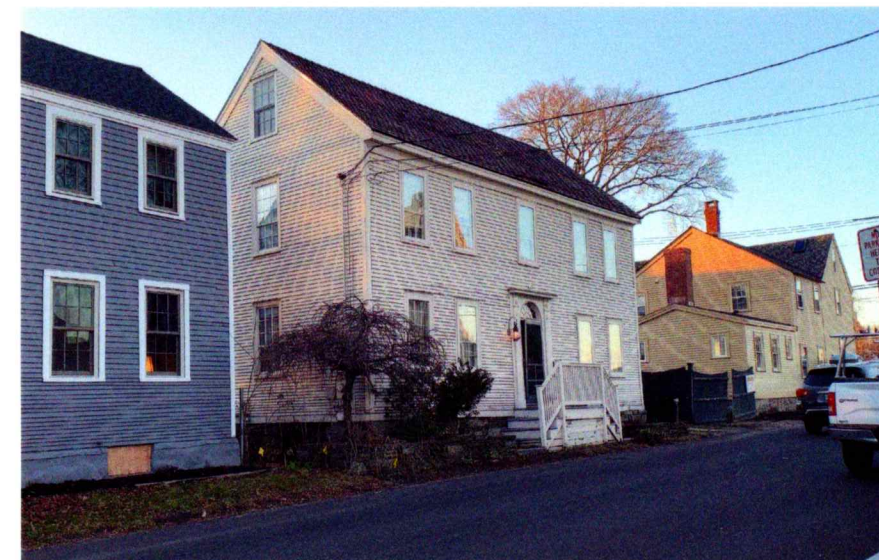
VIEW OF FRONT ELEVATION