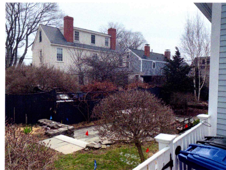
VIEW FROM DRIVEWAY OF 28 SOUTH STREET