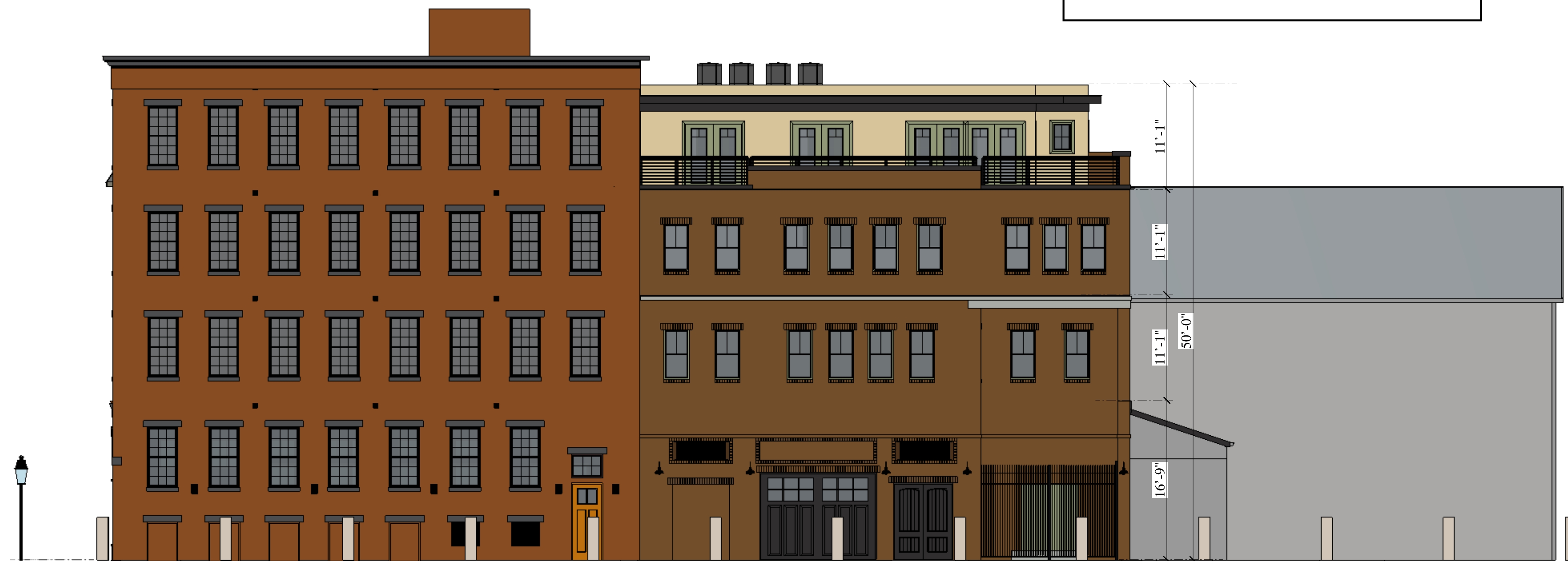
CHURCH STREET ELEVATION SCALE: 1/8" = 1'-0"