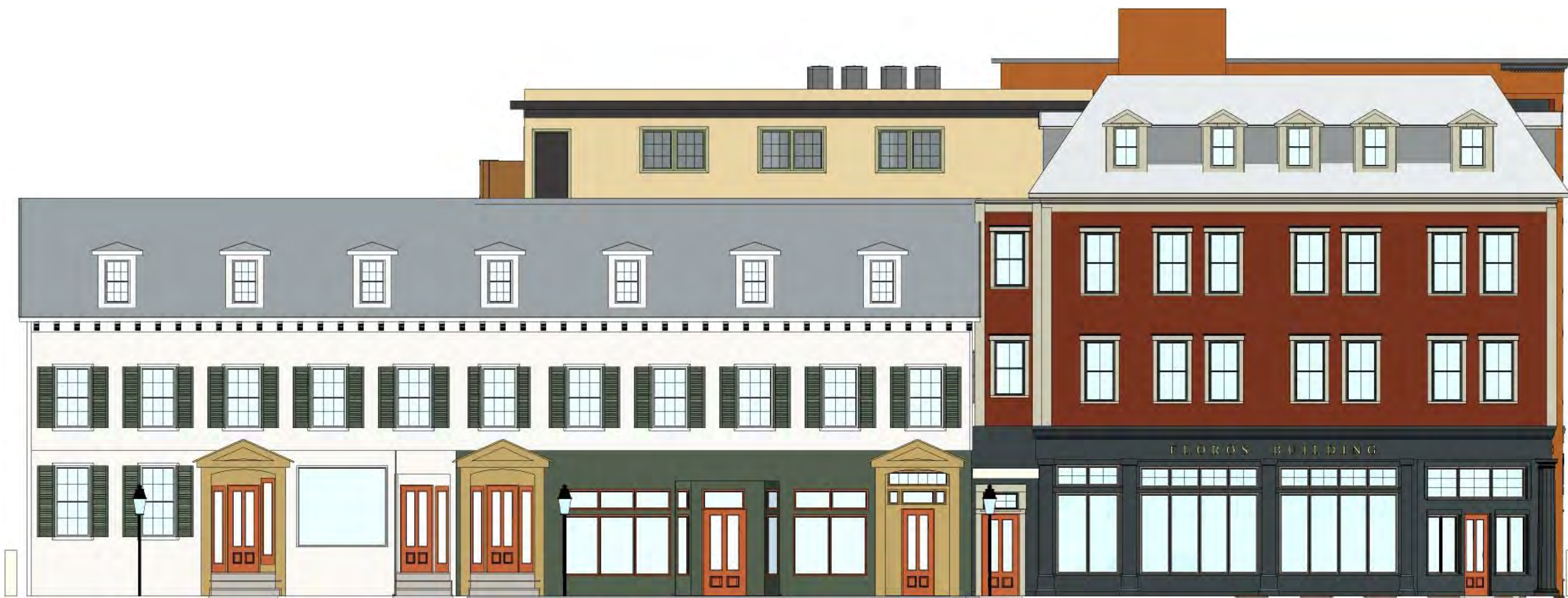
PLEASANT STREET ELEVATION