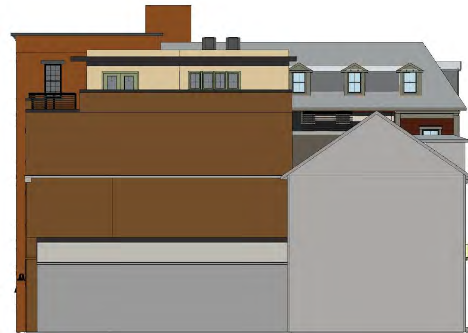
CHURCH STREET ELEVATION