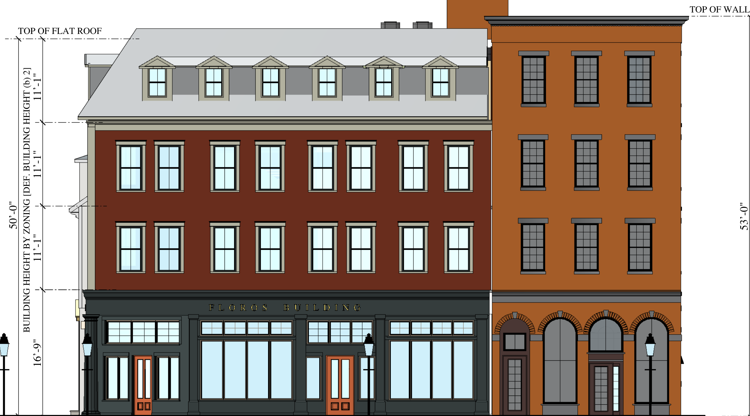
STATE STREET ELEVATION SCALE: 1/8" = 1'-0"

ELEVATOR OVERRIDE EXCLUDED FROM HEIGHT BY ZONING 10.517.30 AND BY "PENTHOUSE" DEFINITION