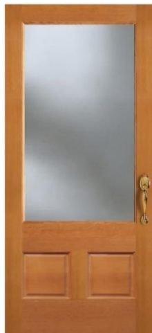
521 Traditional Sash