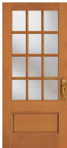
512 Traditional Sash