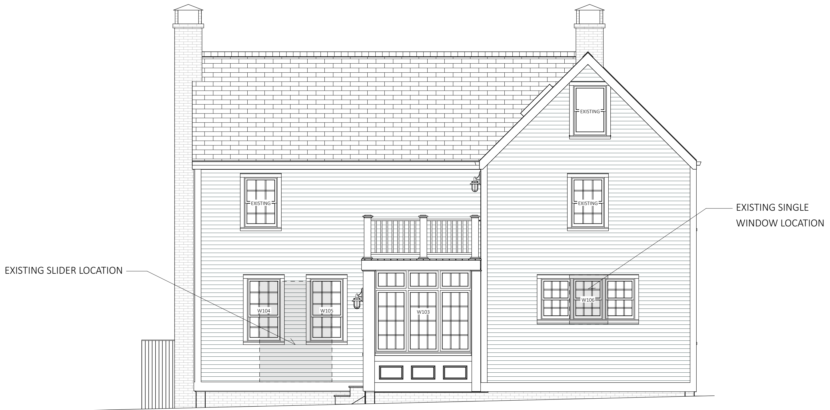
ELEVATION 1 - OPTION 1 1/4 IN = 1 FT