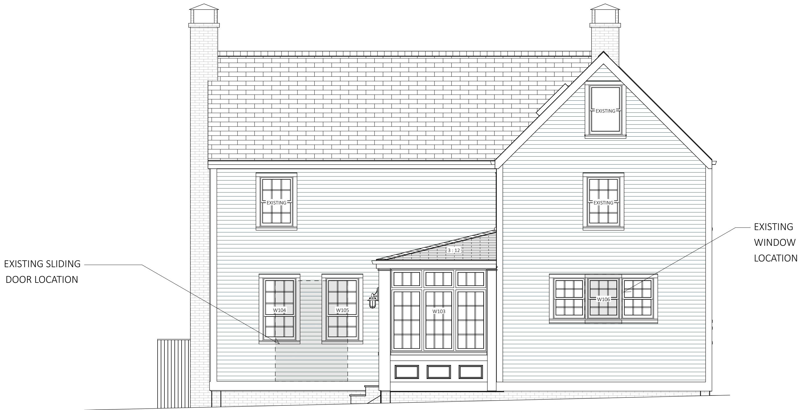
E2 ELEVATION 1 - OPTION 2 1/4 IN = 1 FT