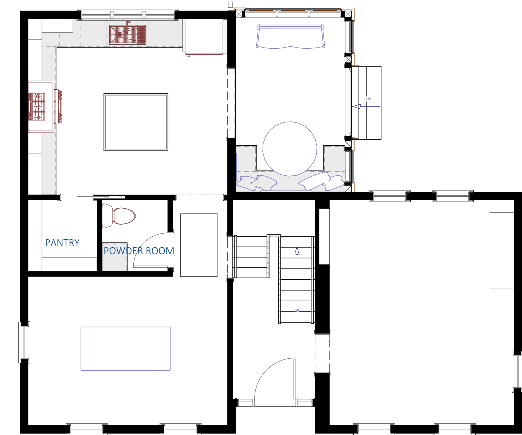
○ PROPOSED FLOOR PLAN 1/4 IN = 1 FT