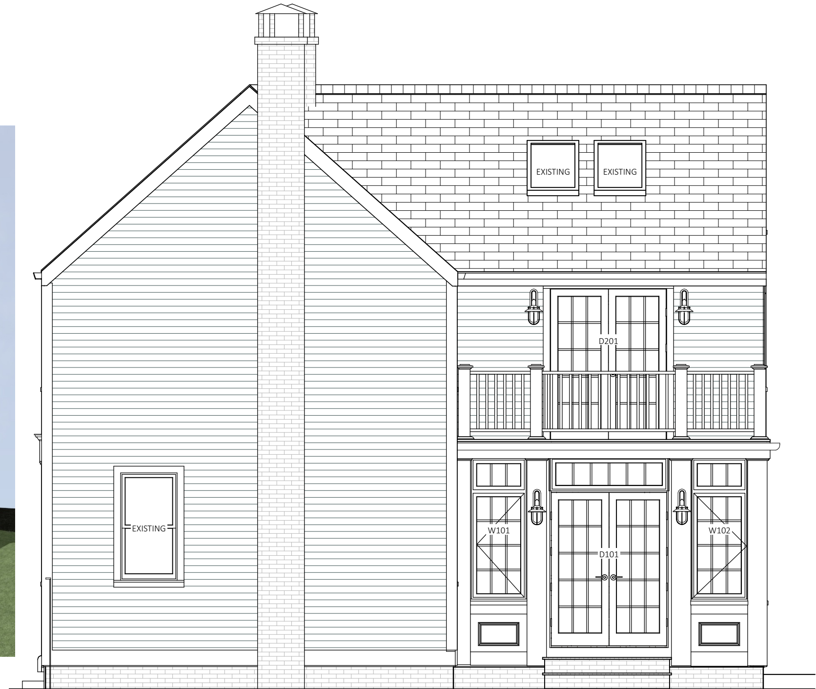
○ ELEVATION 2 - OPTION 1 1/4 IN = 1 FT