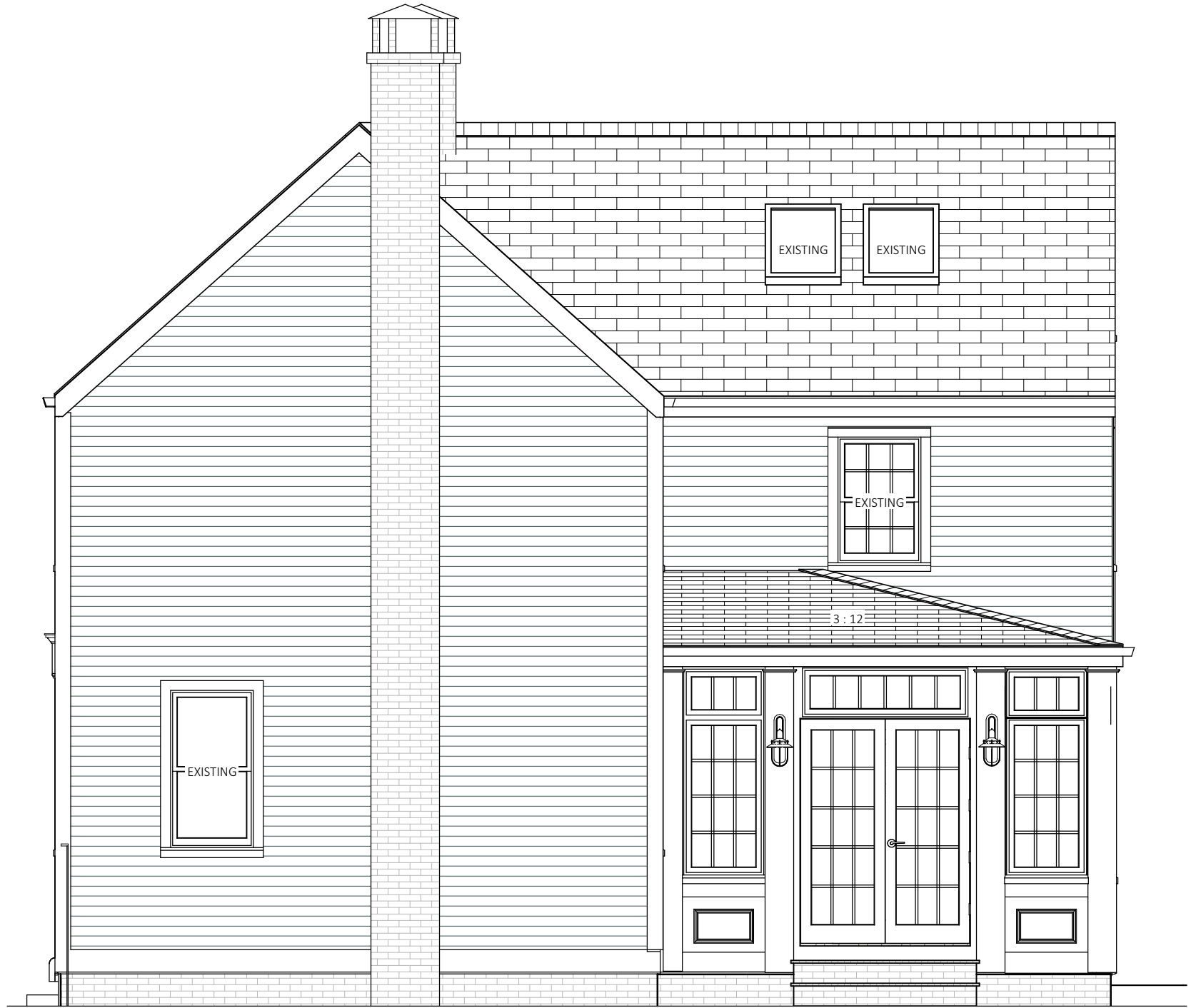
E3 ELEVATION 2 - OPTION 2 1/4 IN = 1 FT