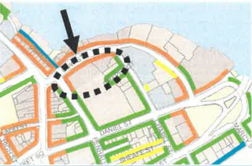
Existing Building Height: 2-3 stories (short 4 th ) / 45'