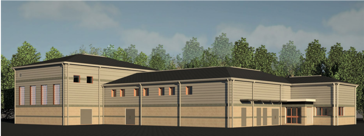
Rendering of Proposed Drinking Water Treatment Facility Upgrade – Grafton Road

The City of Portsmouth and the United States Air Force have recently signed their latest agreement to treat perfluorooctanesulfonic acid (PFOS) and perfluorooctanoic acid (PFOA) from water supplied by the Smith, Harrison and Haven Wells serving the Pease Tradeport drinking water system. The agreement will provide the City with up to $14.3 million to reimburse the cost of construction of the final treatment system for all three wells, which will include a dual filtration system consisting of resin and granular activated carbon filters. We anticipate bidding the project this fall with construction beginning in the spring of 2019.