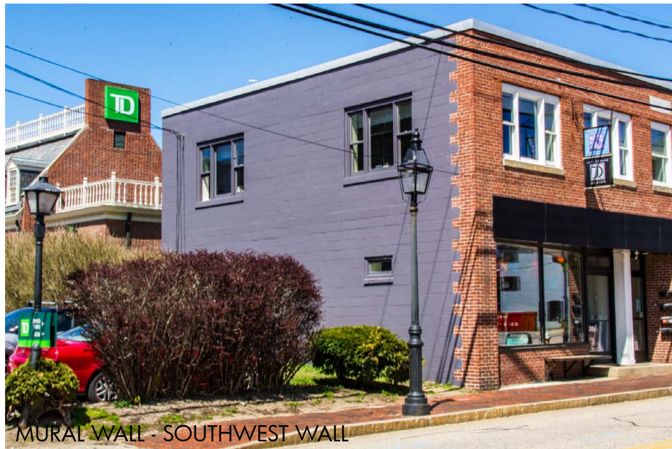
MURAL WALL - SOUTHWEST WALL