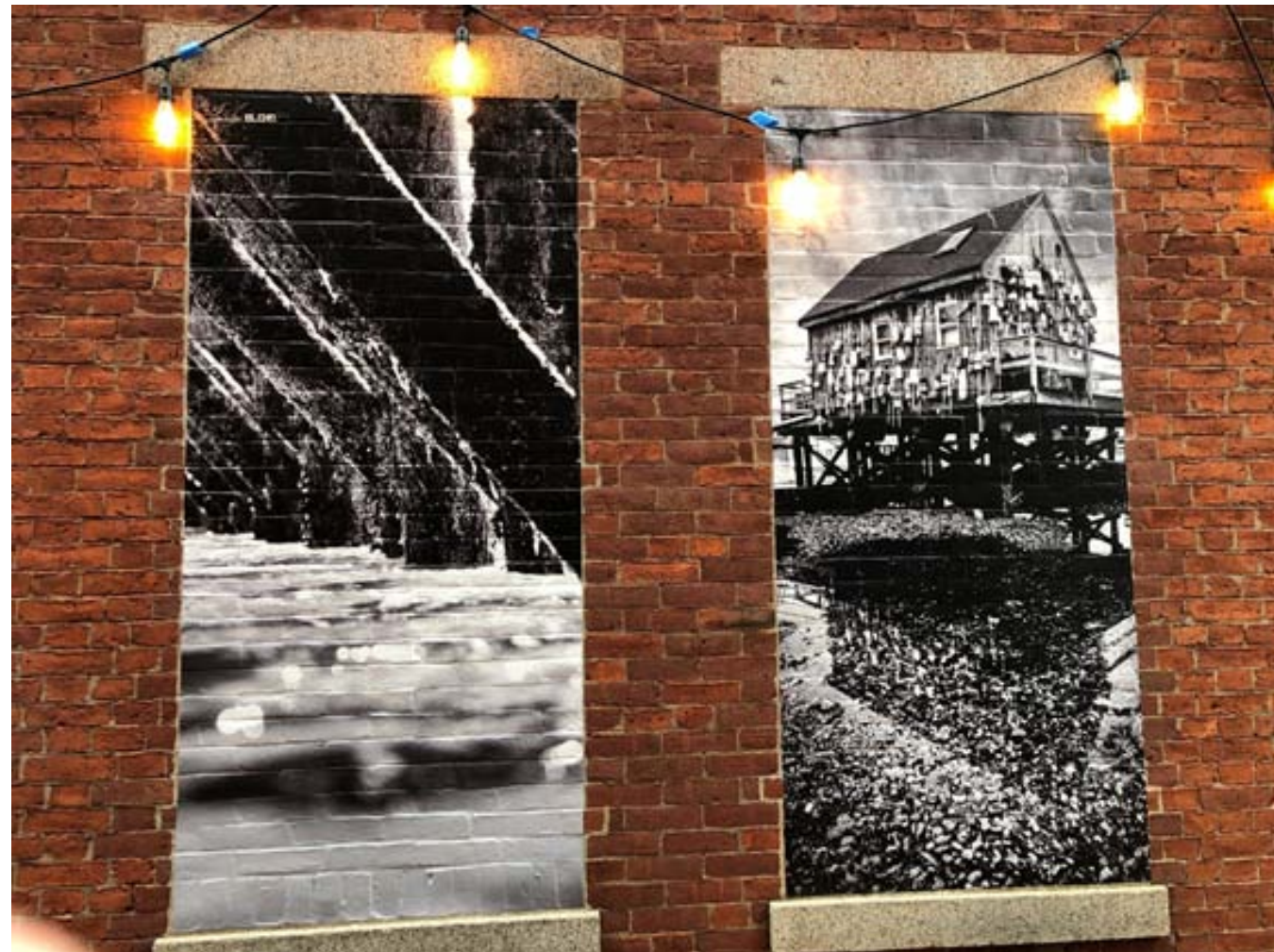
MURALS ON COMMERCIAL ALLEY WITH SIMILAR MATERIAL

The entirety of the mural itself (rendering, title, text, etc.) will be printed on an adhesive vinyl material similar to a few comparable murals in the downtown area.