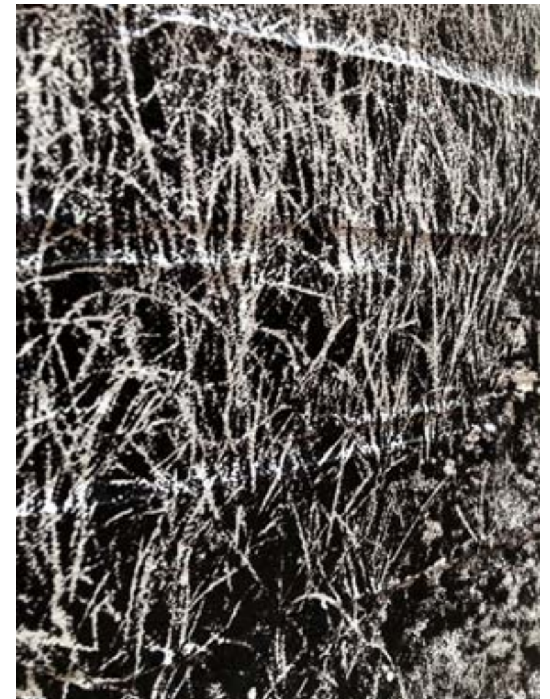
PROFILE OF BRICK AND MORTAR JOINTS VIEWED THROUGH VINYL MATERIAL