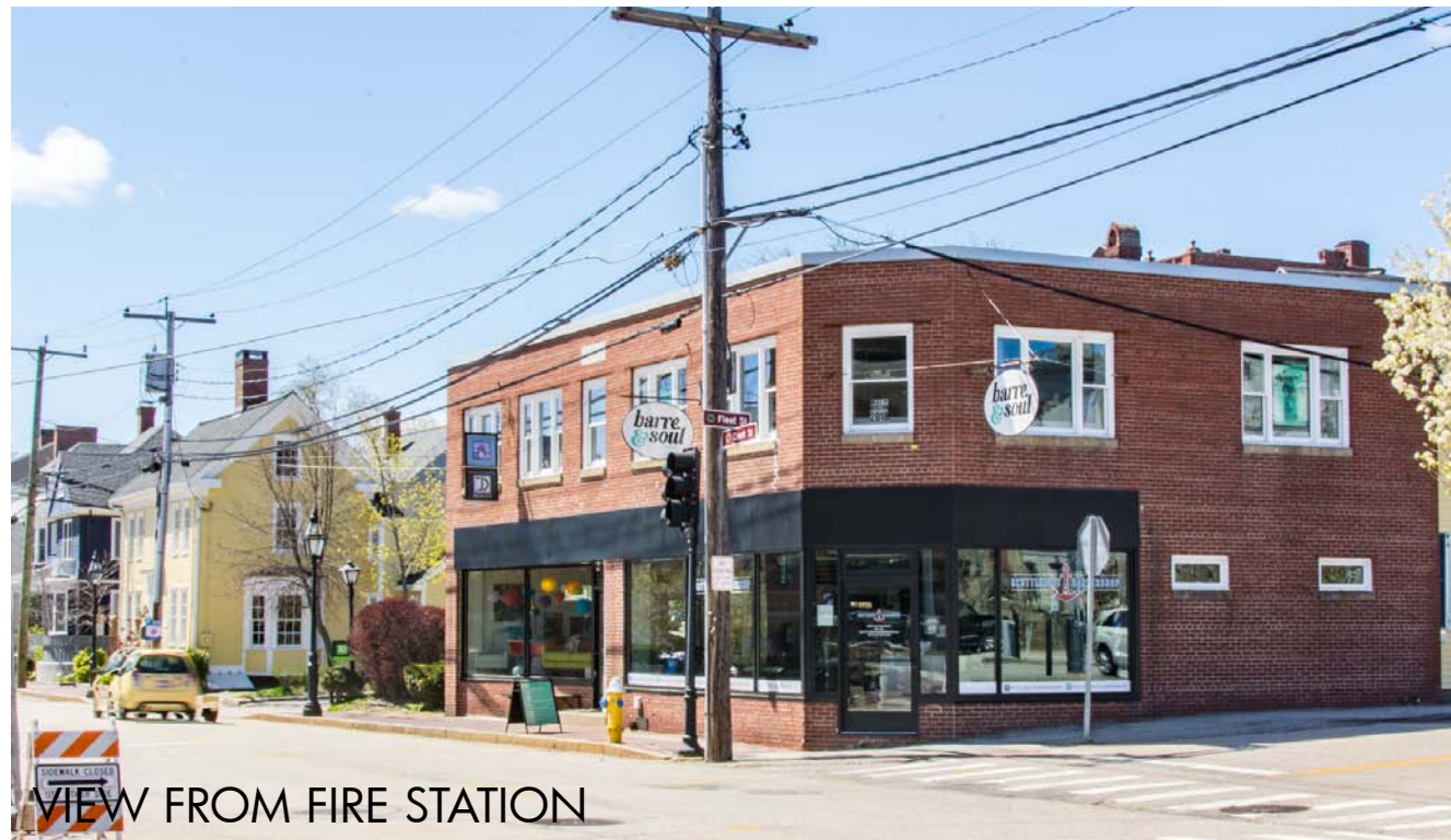
VIEW FROM FIRE STATION