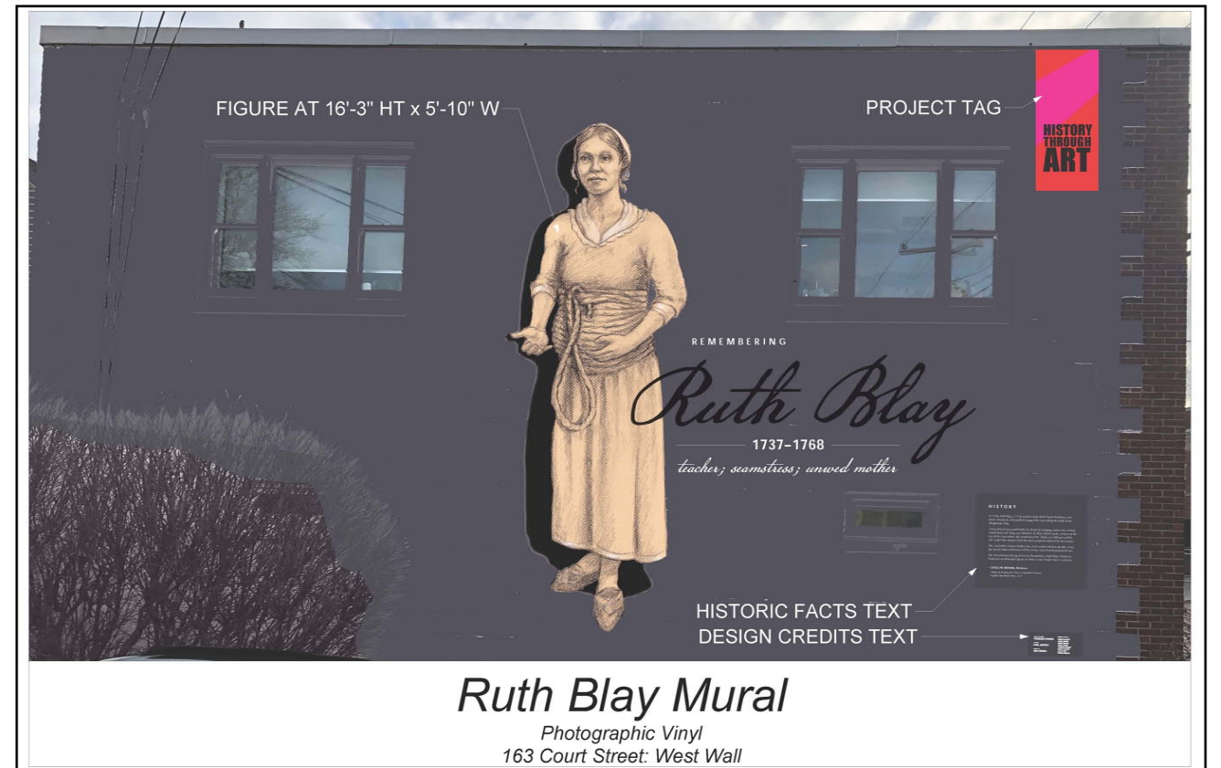
Ruth Blay Mural

A mural is being proposed at the southwest wall of the 165 Court Street building. The mural will contain a unique artist’s rendering of Ruth Blay with associated title, historical facts, design credits, and a “History Through Art” tag intended to identify and link together this installation with other future murals focused on a variety of Portsmouth women.