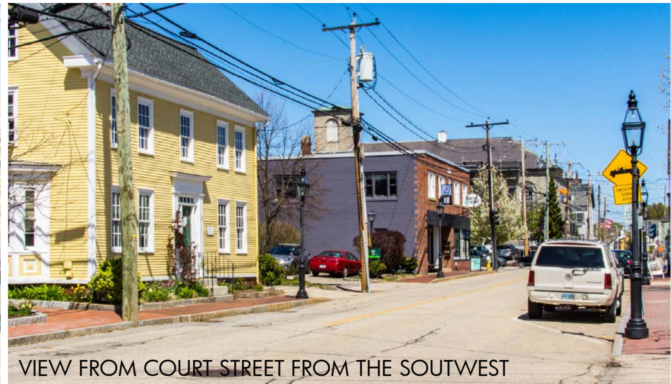
VIEW FROM COURT STREET FROM THE SOUTHWEST