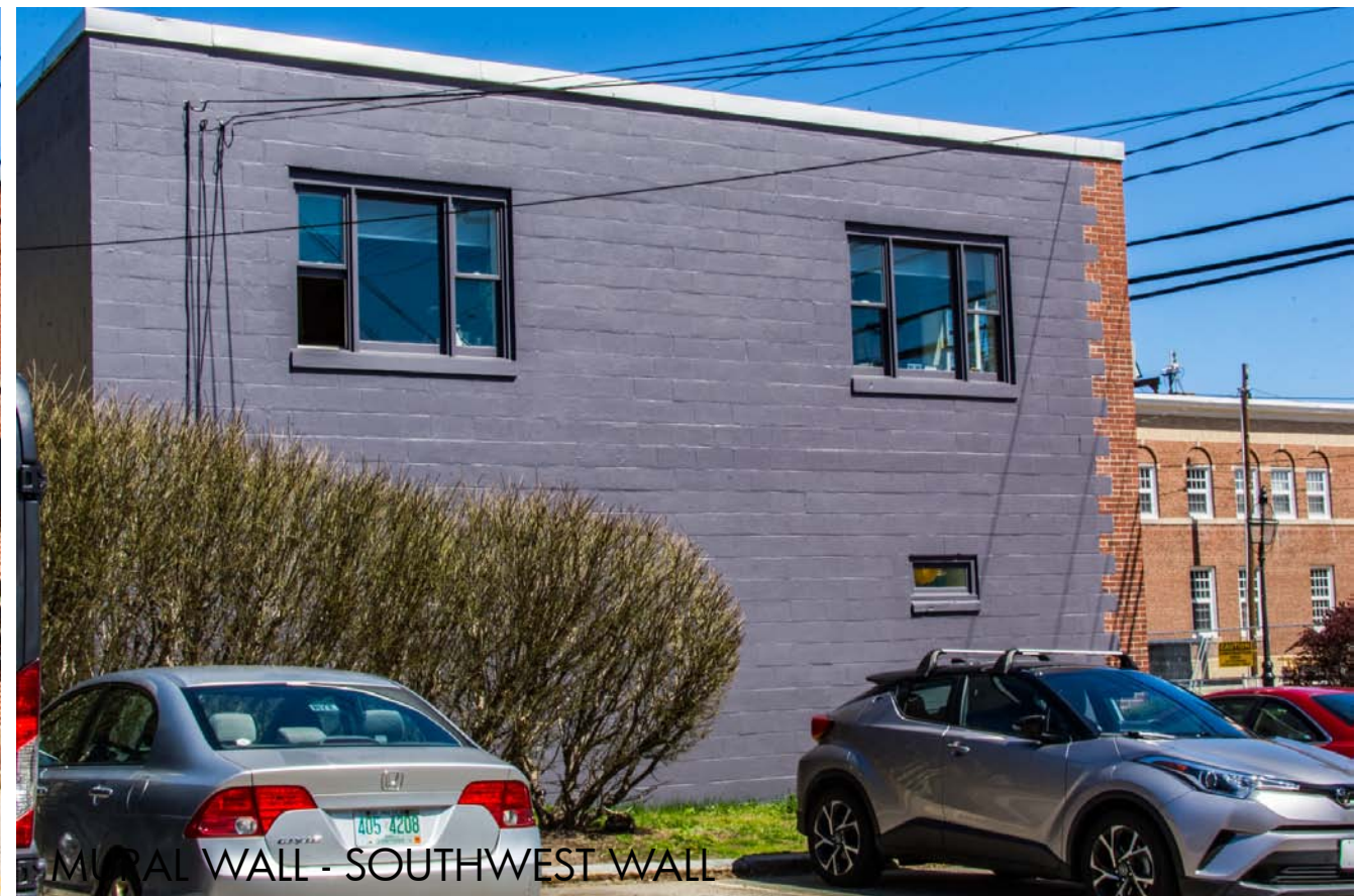
MURAL WALL - SOUTHWEST WALL