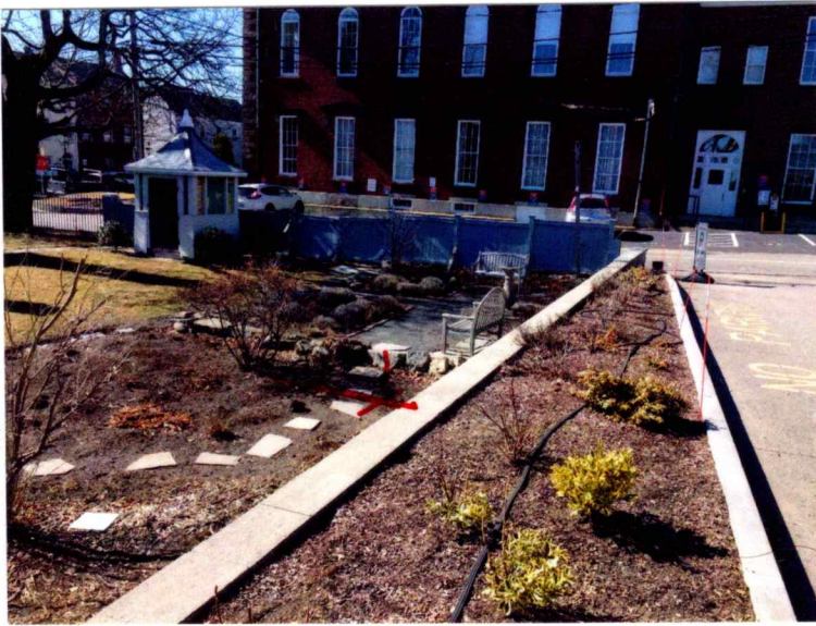
VIEW OF CARRIAGE HOUSE SITE LOOKING WEST