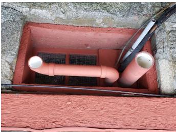
Existing furnace Intake/Vent