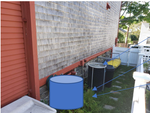
Detailed view of proposed installation of new AC compressor