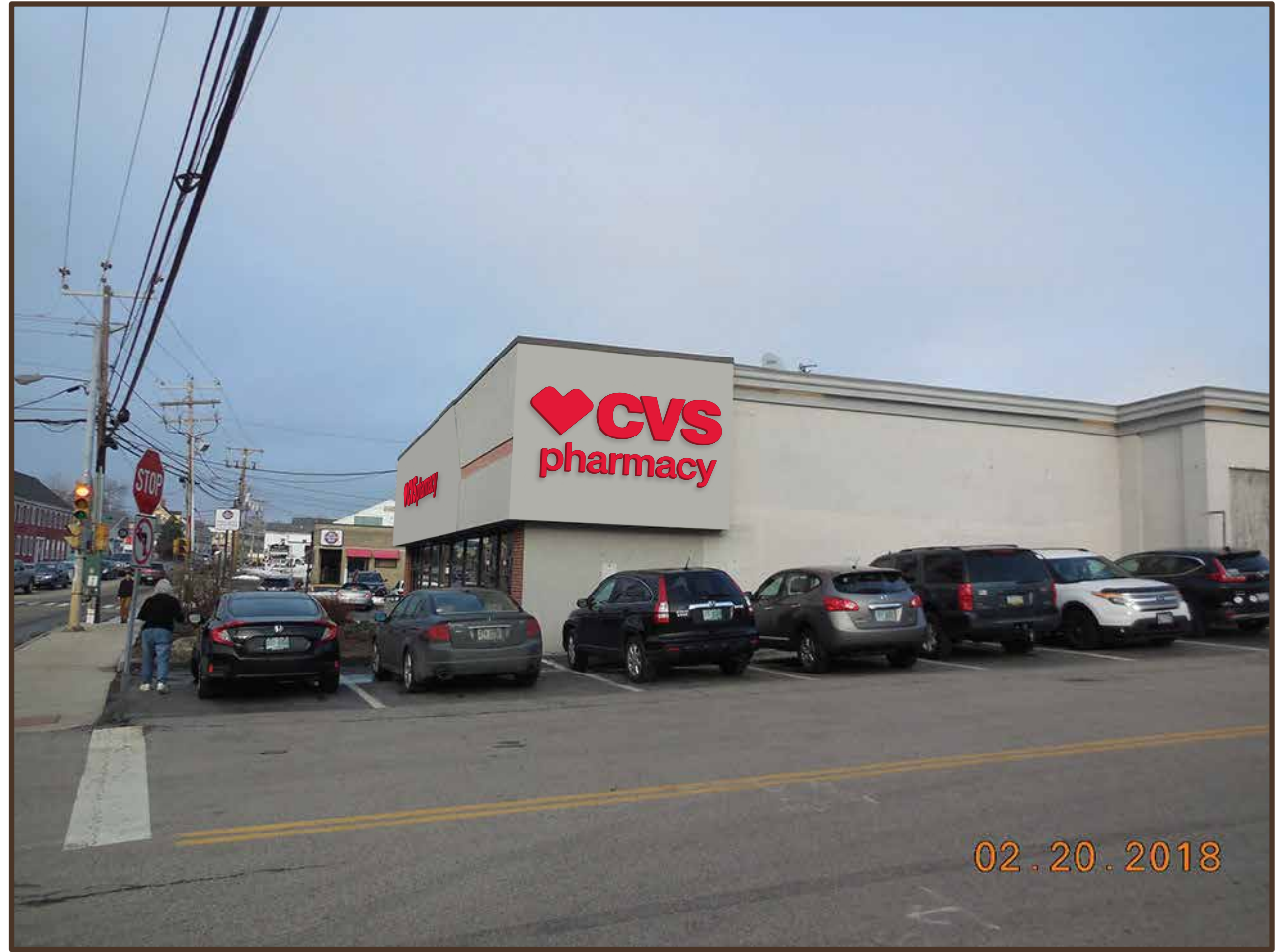
Proposed Signage - Elevation