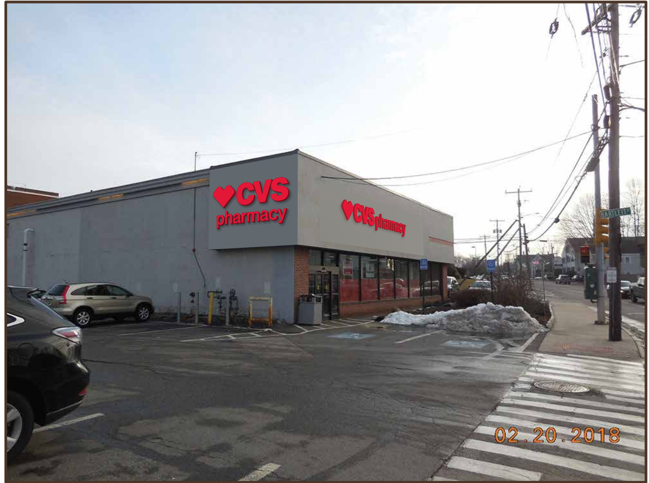
Proposed Signage - Elevation

Store Hours Plaque (inside breeze way) S/F D/F Illuminated Yes No