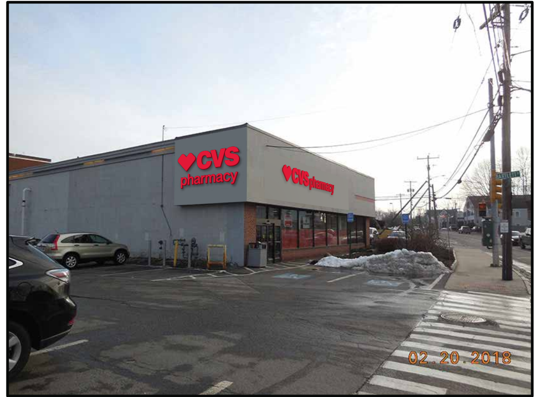
Proposed Signage Overview