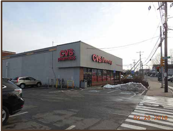
Existing Signage - Elevation

36" CVS pharmacy Channel Letters on Raceway S/F D/F Illuminated Yes No