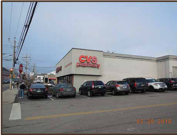
Existing Signage - Elevation

36" CVS pharmacy Channel Letters on Raceway Illuminated