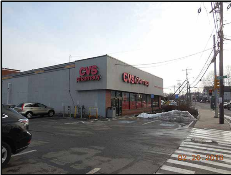
Existing Location Overview