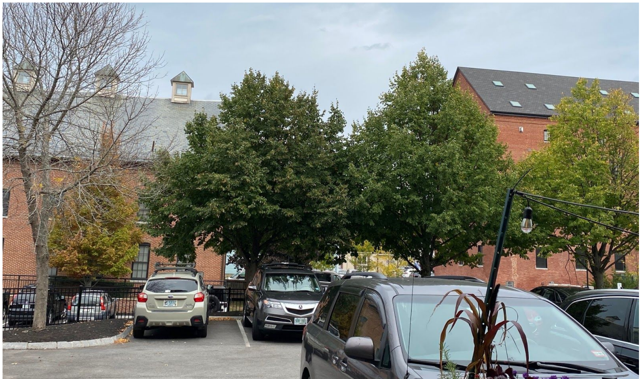
Final image of neighboring frank Jones building, showing aesthetic and structural quality of the roof.