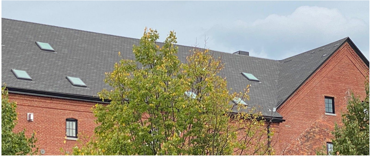
Image of my building next to the building with the building with the slate line shingles (in order to show proximity to one another).