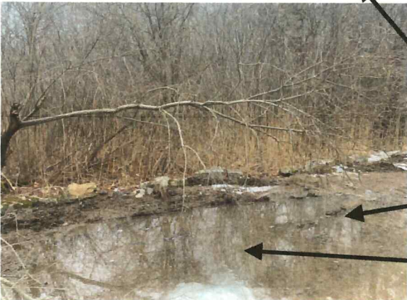
Photographs of Same Area From Opposite Direction