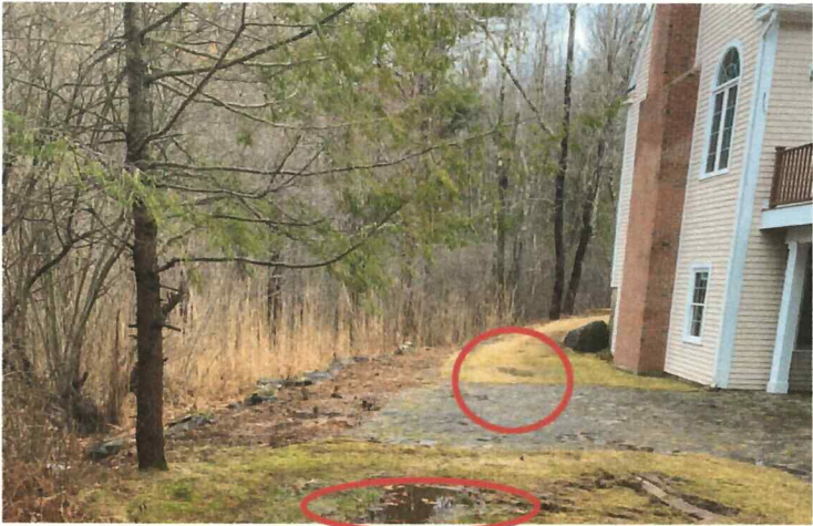
Exhibit #2 Photographs of Rainwater Collection