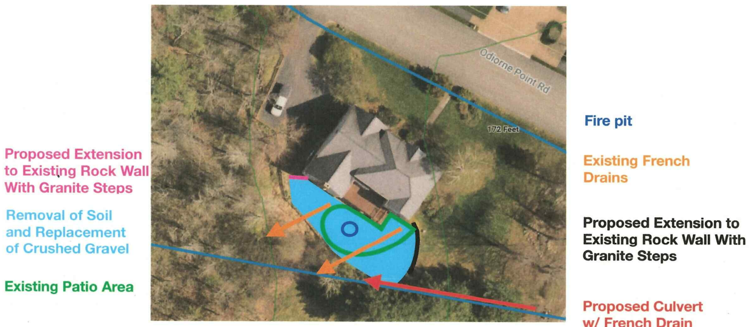
Exhibit #3, Proposed Hardscape Alterations