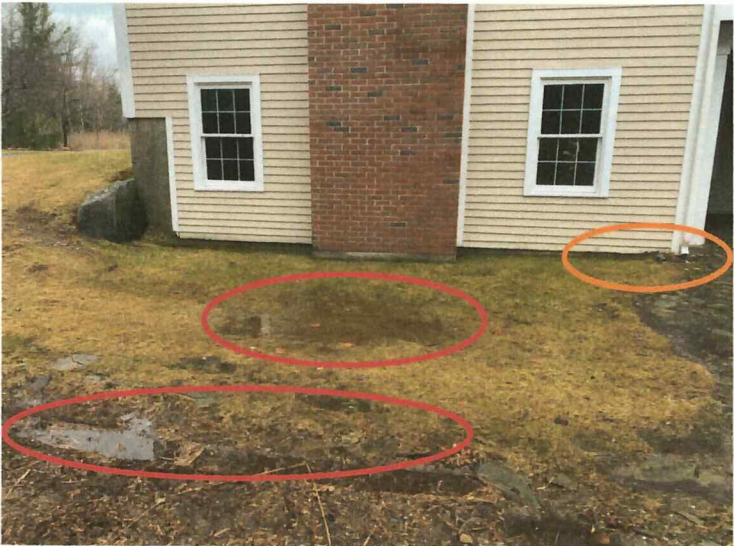
Rainwater Damaged Patio/Deck/Stairway