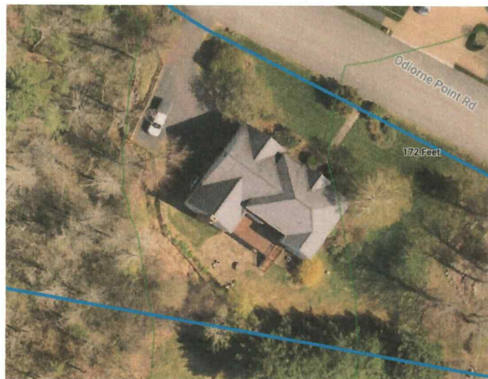
Exhibit #1, City of Portsmouth MapGeo Satellite View of 253 Odiorne Point Road

Objective & Requested Approvals: With the general objective of protecting the existing structure and property from additional rainwater damage; the property owner respectfully requests the following two (2) approvals prior to initiating alterations in the form of repairs and improvements to the hardscape, the landscape, and the structure.