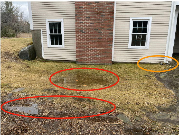
Rainwater Damaged Patio/Deck/Stairway