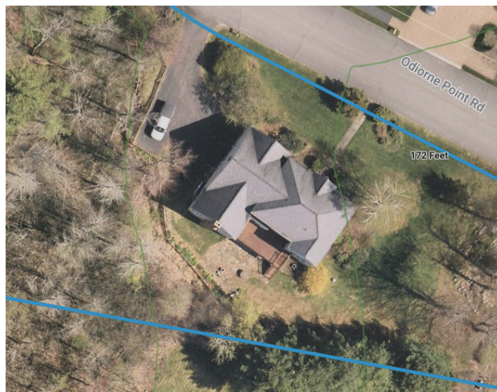
Exhibit #1, City of Portsmouth MapGeo Satellite View of 253 Odiorne Point Road

Objective & Requested Approvals: With the general objective of protecting the existing structure and property from additional rainwater damage; the property owner respectfully requests the following two (2) approvals prior to initiating alterations in the form of repairs and improvements to the hardscape, the landscape, and the structure.