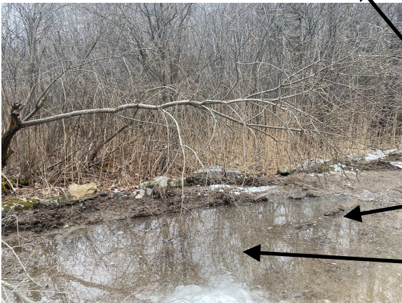
Photographs of Same Area From Opposite Direction