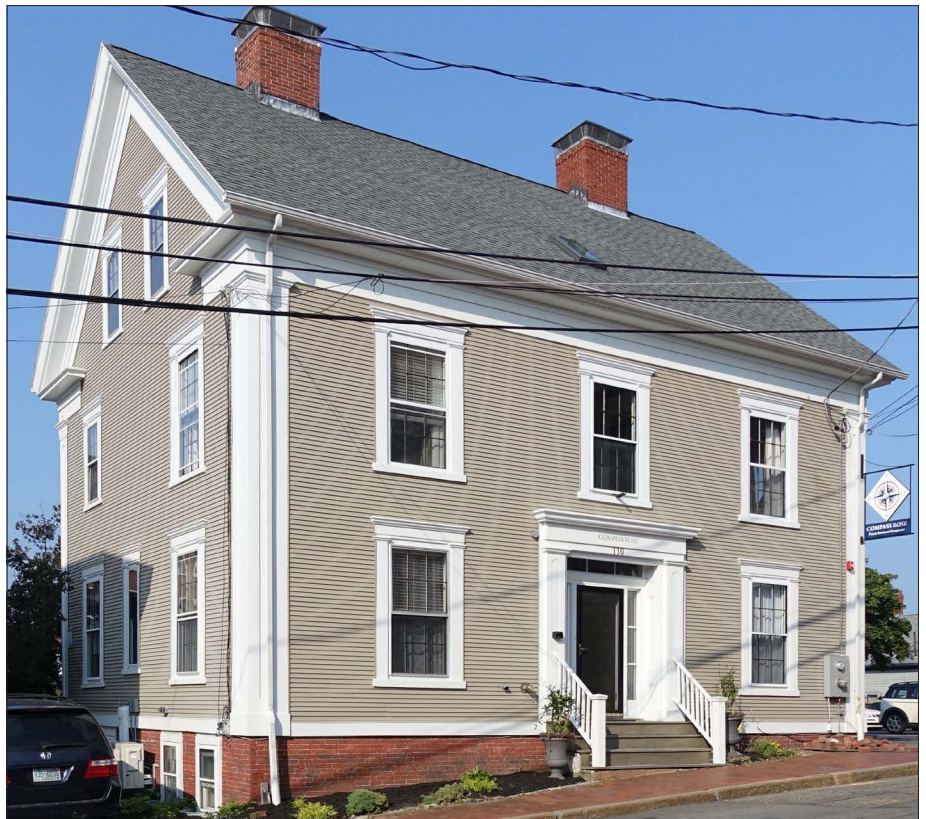
The side-gable roof of this wood-framed has a deep, stepped cornice with gable end returns and wide, classically-inspired, corner boards. The classical entrance surround includes pilasters and a wide, stepped frieze. The door is flanked by sidelights with a transom above.