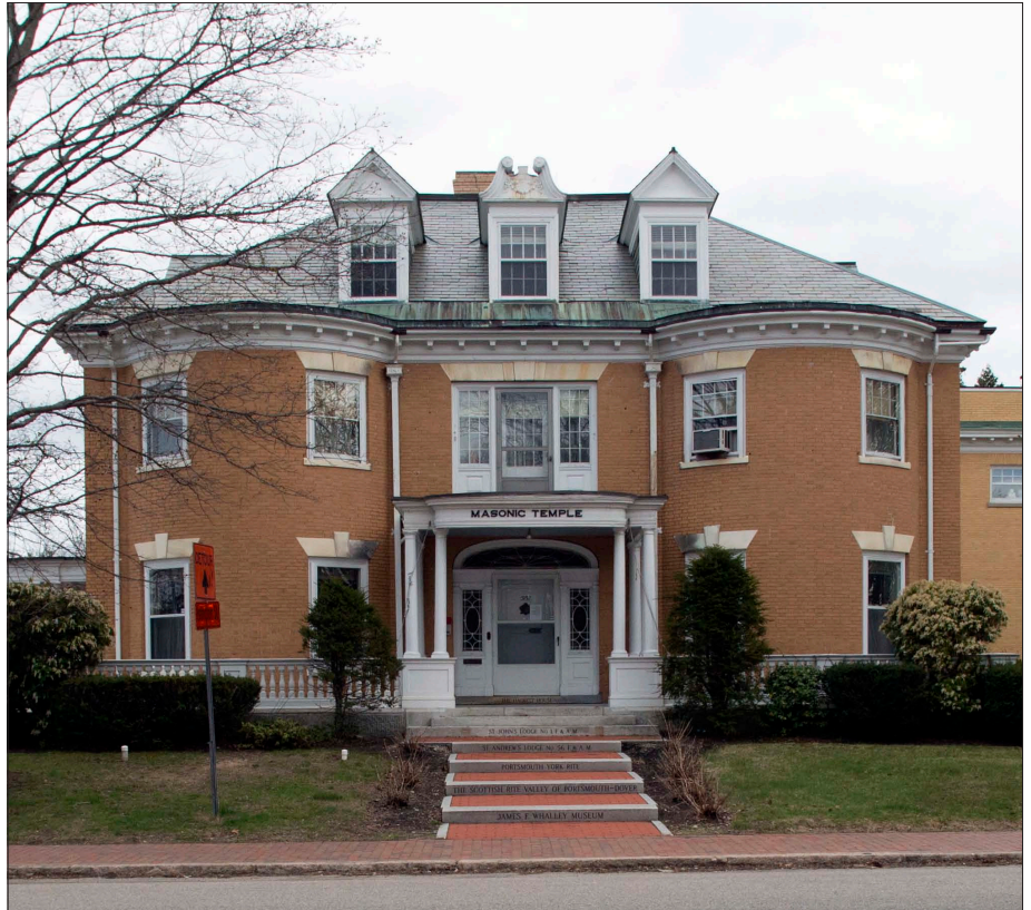
The slate, hipped roof on this 2-1/2 story, Colonial Revival residence include three dormers. The entry porch is centered on the front elevation and includes a paneled wood door and decorative sidelights topped by an arched transom.