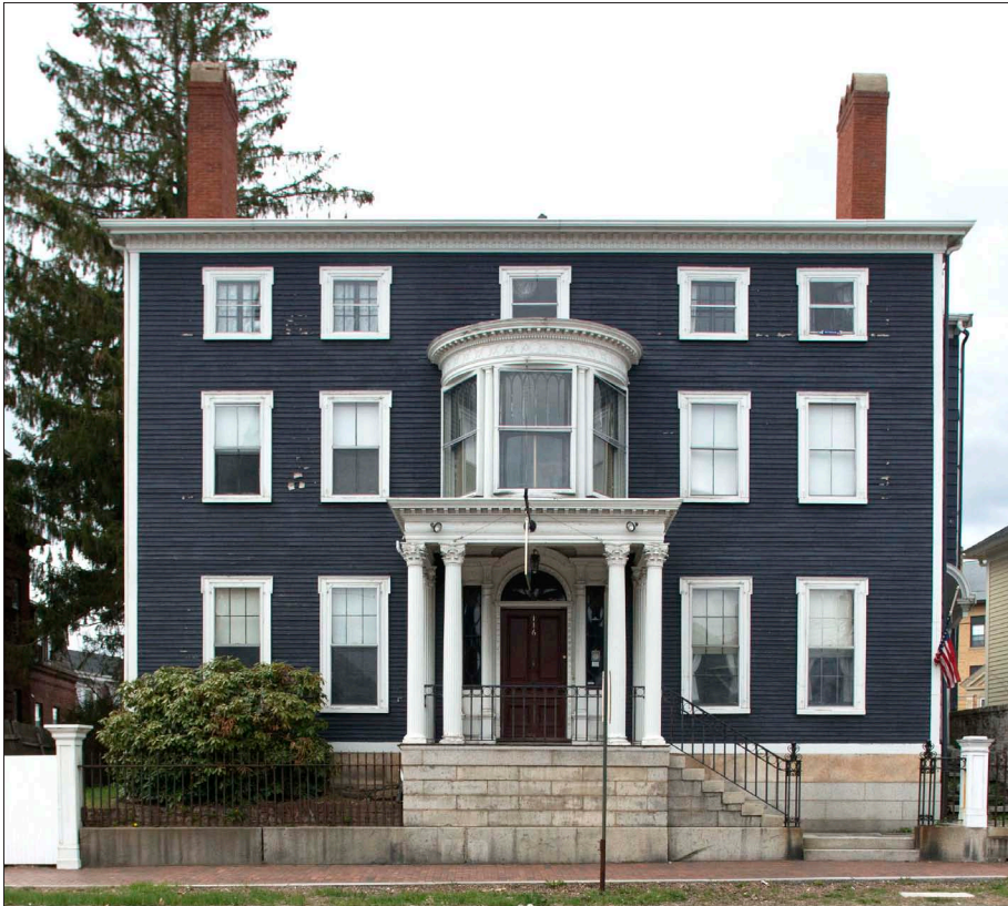
This wood-framed Federal residence includes a central entrance door below a half-round fanlight flanked by sidelights. The projecting entrance porch has paired Corinthian columns and a classical cornice topped by a half-round bay and decorative iron railing (a later addition).