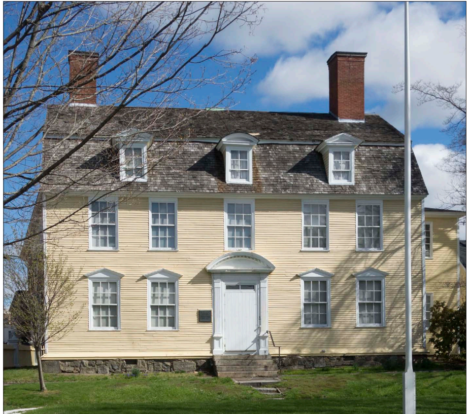
The 1758 John Paul Jones house includes a side-gambrel roof, massive brick chimneys, arched and pedimented dormers. The wood-framed house has clapboard siding and a fieldstone foundation. The 6/6 double-hung windows at the first floor include pedimented lintels.