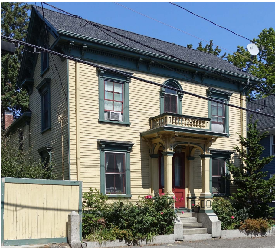
This side-gabled, Italianate residence has a projecting, cornice with paired brackets. A prominent entrance porch includes an extended bracketed cornice and balustrade above. Windows have 2-over-2 double-hung sash with prominent, bracketed lintels.