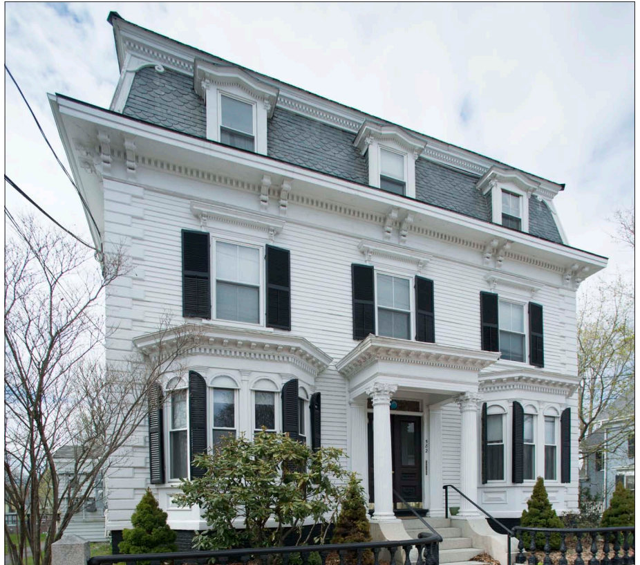
This Second Empire home includes a Mansard roof and projecting cornice with paired brackets. The elements below the cornice, including the pair of projecting bay windows and the 2-over-2 double-hung windows with decorative lintels, are similar to those found at Italianate homes.