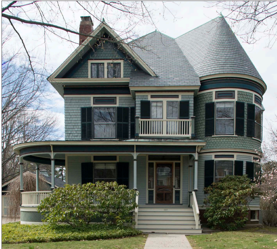
The complex roof form at this Shingle Style includes a hipped roof with an intersecting gable and round tower projection. A semi-circular porch supported by turned wood posts with simple brackets wraps the left side of the house.