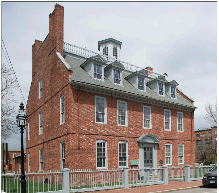
The 1716 Warner House includes a side-gambrel roof with massive brick chimneys, arched and pedimented gables, a central cupola and a roof balustrade. The Flemish bond brick walls include belt courses at each level. First and second floor double-hung windows have 9/6 sash.