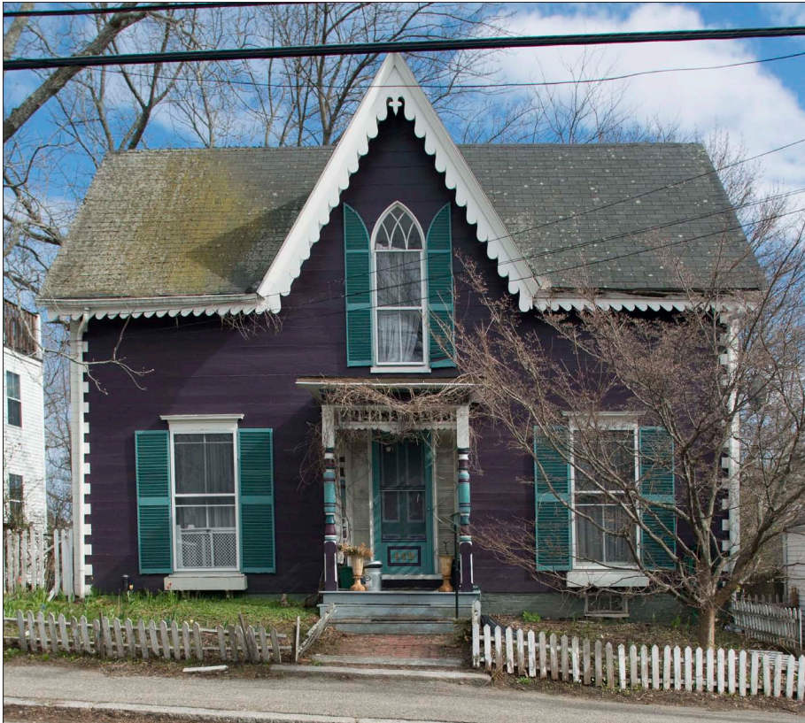
This Gothic Revival residence has a steeply pitched, cross gabled roof. A decorative, scalloped vergeboard is located at the front gable with a similar motif along the eave. The front gable features a tall, pointed arch lancet window, typical of the style.