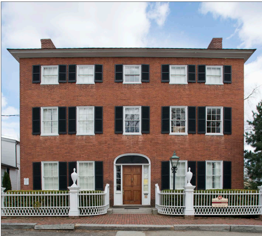
This austere Federal residence is constructed of brick, and includes a central paneled wood door flanked by sidelights and topped by an elliptical fanlight. Windows all have double-hung, multi-light sash and are flanked by shutters.