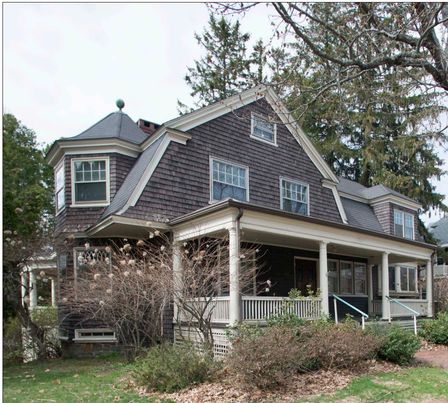
A semi-octagonal tower intersects the side of this gambrel-front shingle residence. The double-hung windows include multi-paned upper sash over a single-paned lower sash. The front porch is supported by Doric columns and includes a simple, wood balustrade.