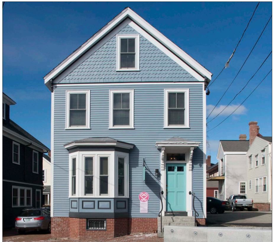
Many Vernacular (or Folk) Victorian residences are relatively simple in form, and include a few Victorian details such as decorative gable ends, projecting bay, and decorative detail at the entrance porch, or in this case, door hood.