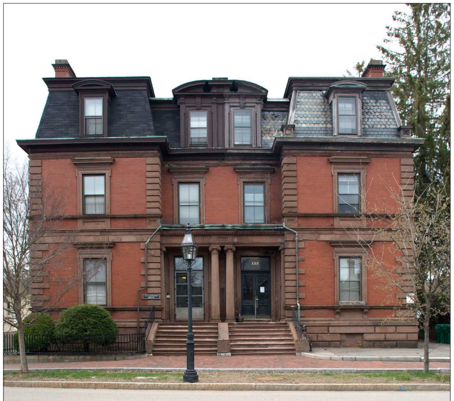
Although a symmetrical building, this is a Second Empire paired residence. The decorative, slate, fish scale shingles remain at the right half of the Mansard. The brick walls feature brownstone quoins, belt courses and window surrounds. Note that the former balustrade has been removed.