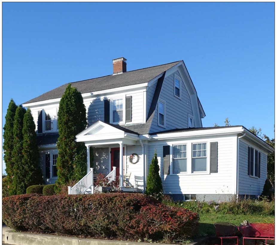
Dutch Colonial Revival residences, such as this one, typically have a side gambrel roof, often with wide, shed-roof dormers. Double-hung windows with 6-over-1 windows are installed throughout.