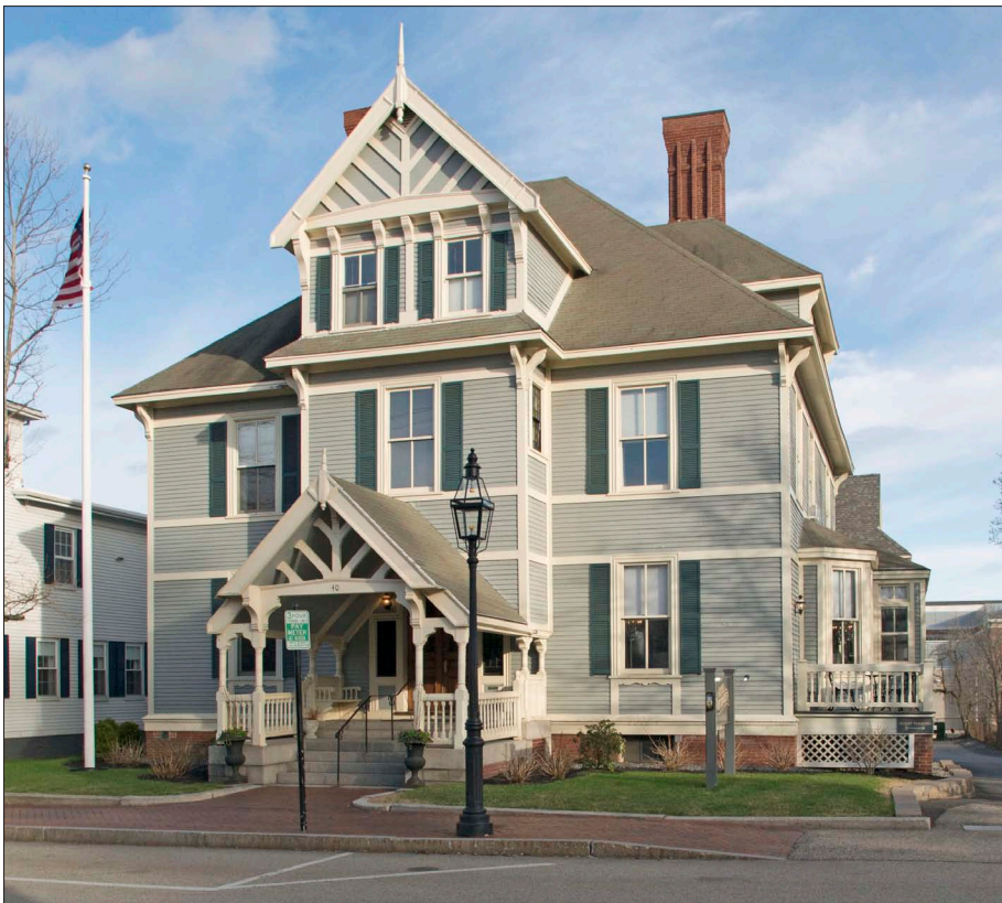
Stick Style buildings are wood framed and can include decorative patterns and details. This building features a gabled dormer with a diagonal board patterns with a similar pattern used to frame the entrance porch below. Windows have 2-over-2 double hung sash.