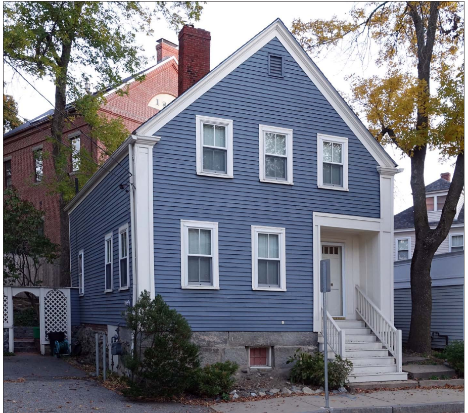
Many of Portsmouth's Greek Revival residences are wood framed with front-gable roofs. This example includes a wide rake board with molded trim and classically-inspired corner boards frame the front elevation, as well as a granite foundation.