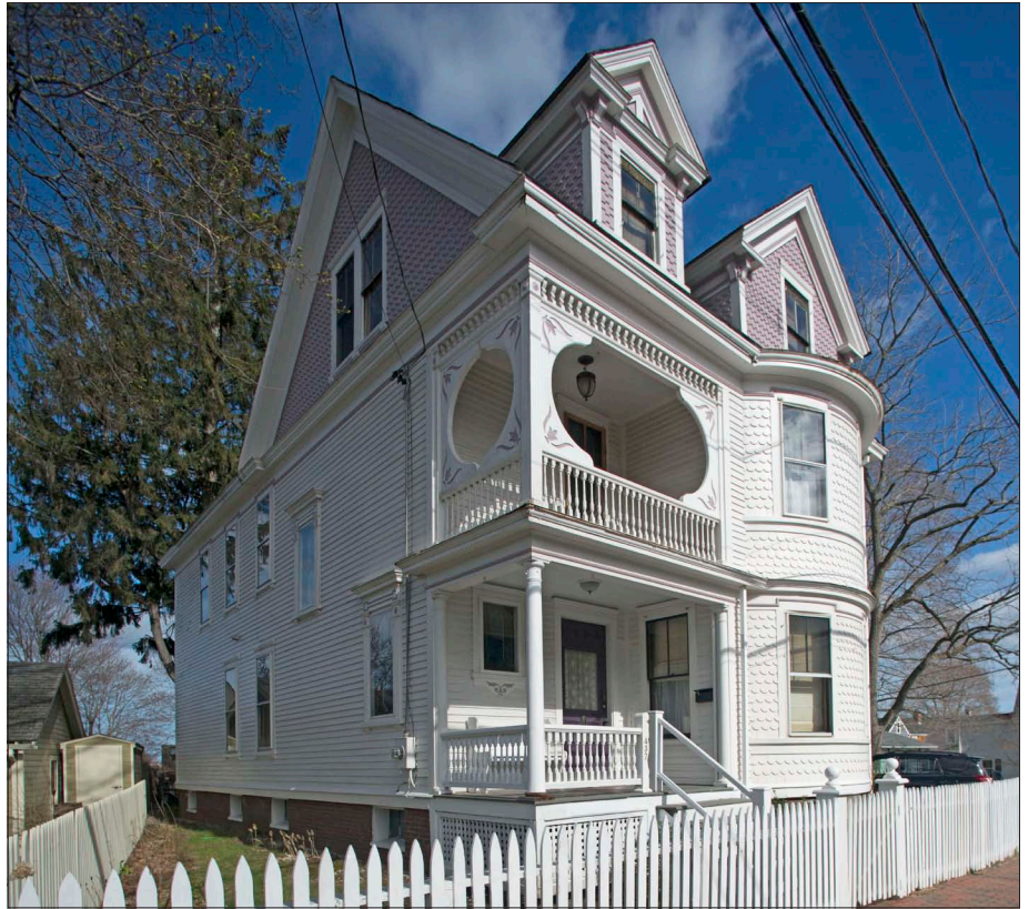
This Queen Anne residence has asymmetrical massing with an inset, double-height porch to the left and a shingle-clad, tower-like semi-circular bay to the right. The porch includes turned railings and a spindlework frieze and jigsaw cut panels at the second floor.