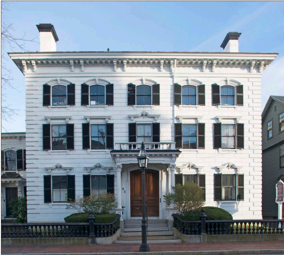
This wood-framed Italianate house has a projecting, denticulated cornice with paired brackets. The symmetrical facade has paired, arched, panelled entry doors and 2-over-2 double-hung windows with elaborate window hoods. Arched windows are located at the third floor.