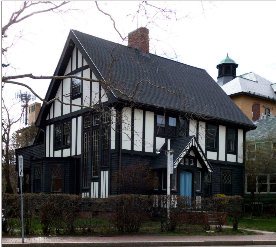
This former Gothic Revival residence was remodeled as a Tudor Revival. Two of its principal features are the highly articulated gabled front entrance and three dramatic, stepped, multi-light windows at the side elevation. The half-timbering has a rectilinear pattern.