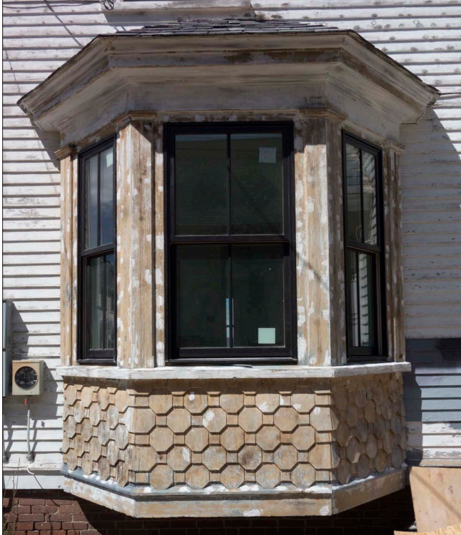
Repainting should be considered as part of regular exterior maintenance as a means of protecting wood from exposure to the elements and moisture-related deterioration.

These Guidelines were developed in conjunction with the City of Portsmouth's Historic District Commission (HDC) and the Planning Department. Please review this information during the early stages of planning a project. Familiarity with this material can assist in moving a project quickly through the approval process, saving applicants both time and money.