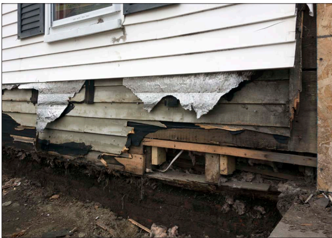
Removal of the vinyl siding has exposed the underlying wood siding and prior repairs to the wood framing system. The structural condition of the wall should be evaluated prior to repairing the siding.

It is prudent for property owners to inspect their buildings and properties regularly to identify potential problems. If problems are detected early, smaller investments of money may not only improve a property's overall appearance and value, but can prevent or postpone extensive and costly future repairs. Regular maintenance items include painting and cleaning gutters and downspouts. It is prudent to inspect the roof for any signs of moisture infiltration, open joints, missing components, and cracks or bulges.