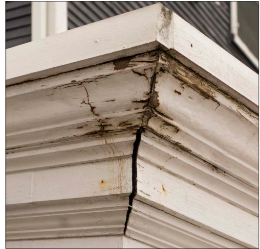
An unsuccessful repair has been applied to the top of this wood pier that does not address the open joint at the cap moulding.

If there are questions regarding whether the severity of deterioration warrants replacement, consultation with a professional is recommended. If problems with the paint surface, wood siding or shingles is a reoccurring issue, it could be related to the extreme difference in temperature and relative humidity between the inside and outside from air conditioning and or the type and installation method of insulation in older buildings. Painting of exterior wood elements should be completed when the temperature and relative humidity are within the paint manufacturer’s recommended ranges. (Refer to Building Insulation , page 03-12; Exterior Paint , page 03- 14, Guidelines for Exterior Woodwork and Guidelines for Windows & Doors .)