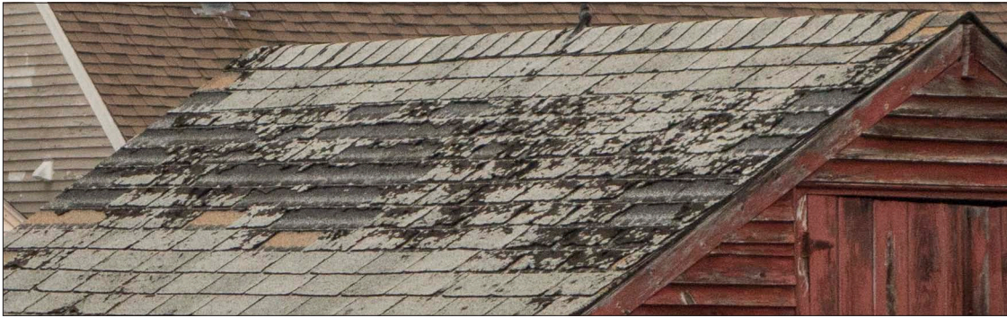
The shingles at this roof surface have exceeded their useful life. Replacement is encouraged to minimize potential water infiltration into the building.