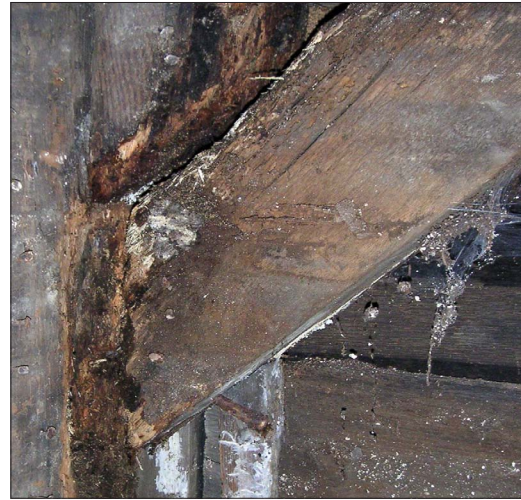
The dark areas at the top of the truss and the white surface residue are both signs of moisture infiltration that should be addressed.

Exterior maintenance problems can be most evident at the interior of a building. The areas most likely to demonstrate exterior problems tend to be the least-visited parts of a house, such as the attic, basement or crawlspace. It is important to remember that attics, basements and crawlspaces are spaces with distinct conditions. Attics sit directly under roofs and thus can be highly susceptible to moisture infiltration. Similarly, a basement or a crawlspace is vulnerable to moisture and pest infestation and damage. Because these spaces typically do not have heat, air conditioning, or moisture control at the same levels as the rest of the building, problems can fester and become severe before being noticed. It is important that these areas, though often awkward to access, receive regular attention.