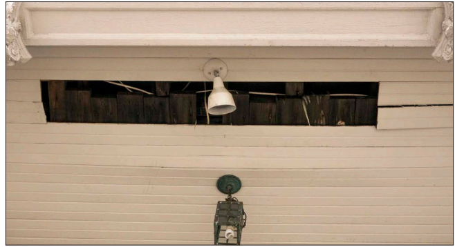
Openings at the exterior of the building can provide access for pests, birds and rodents.

One of the essential missions of the HDC is to protect and preserve historic properties for the benefit of future generations. This includes all exterior historic materials found within the district. To preserve the authenticity of Portsmouth, the HDC strongly encourages the retention of historic materials or replacement in-kind whenever work on a property is considered. Therefore, the HDC recommends repairs that are focused at specific areas of deterioration and that maintain a building's stability and weather resistance, rather than wholesale replacement of a historic building material. It is understood that additional care and attention might be required as part of the effort, but regular maintenance and timely repairs can minimize large repair costs associated with ongoing deterioration.