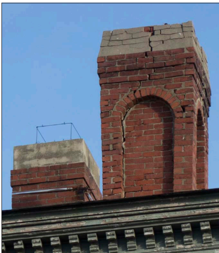
Because of their level of exposure to the elements and temperature changes, chimneys require regular maintenance such as repointing to minimize moisture infiltration into the joints and maintain structural stability.