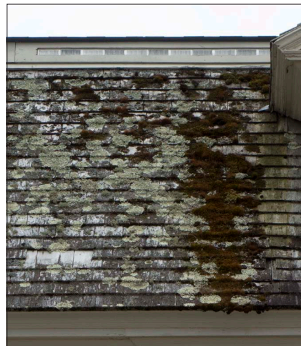
The wood shingles on this roof are covered with lichen, a slow-growing plant that typically forms a crust-like surface that traps moisture in the wood, accelerating deterioration. Also note the missing shingles near the eave.