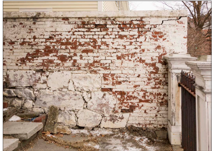
This garden wall, constructed of stone and brick, has deteriorated bricks, mortar loss, and significant cracking at the upper right corner.

Masonry is present in almost all buildings, frequently as a foundation, pier, or chimney, and sometimes as the wall material. Since masonry is often part of the structural system of older buildings, it is critical that it be maintained to prevent serious problems. Masonry and stucco repair and cleaning should be conducted when the temperature is consistently between 40 and 90 degrees Fahrenheit to minimize potential spalling, problems associated with colder temperatures, and shrinkage with warmer temperatures. Painting or coating of masonry and stucco, where appropriate, should be completed when the temperature and relative humidity are within the paint or coating manufacturer’s recommended ranges. For further information, refer to the Guidelines for Masonry & Stucco .