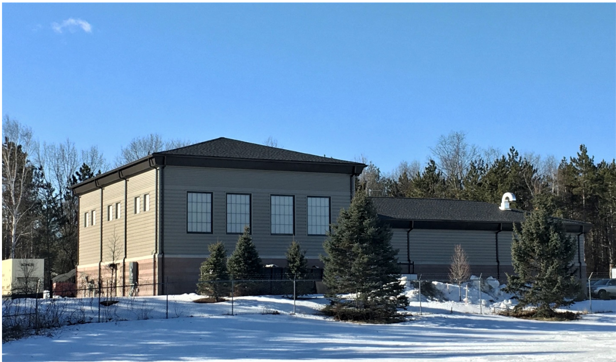
Construction of New Drinking Water Treatment Facility Upgrade – February 2021

Construction of the final treatment system, which includes both resin and activated carbon filtration systems, is nearly complete. The Harrison and Smith wells continue to be treated through granular activated carbon (GAC) and will soon also go through the newly installed IOX Resin Filter vessels. Work completing the new piping, pumps and controls is in the final stages and the system has been tested and approved by the New Hampshire Department of Environmental Services (NHDES) for operation. A copy of that approval letter is included in this update.