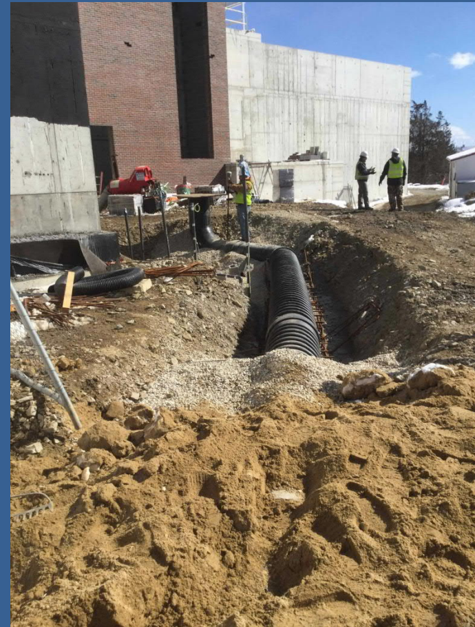
Yard Piping & Utilities