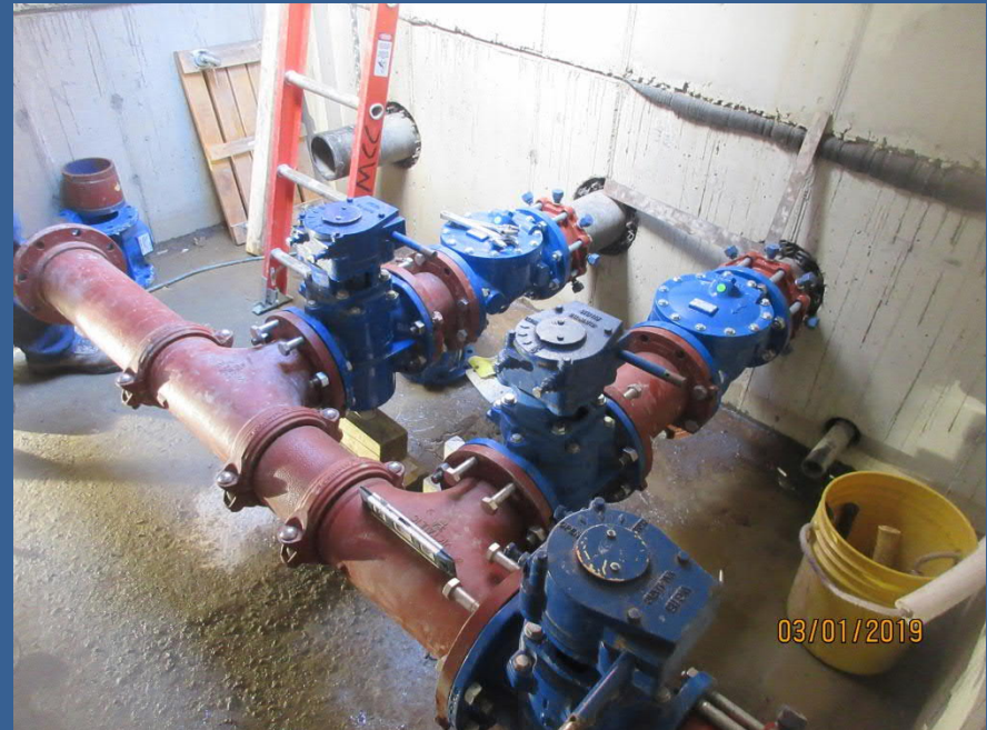
San. Pump Station 1 Valve Vault