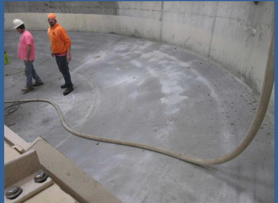
Gravity Thickener No. 2