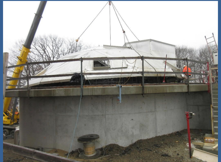
Gravity Thickener No. 2