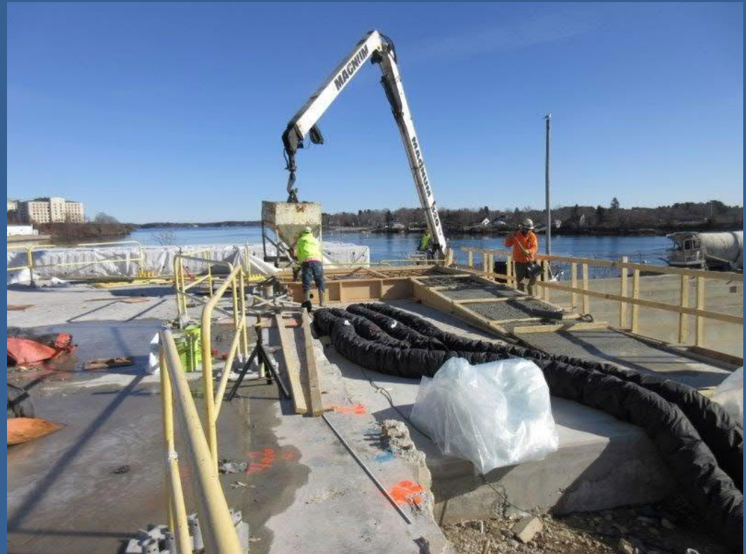
Chlorine Contact Tanks