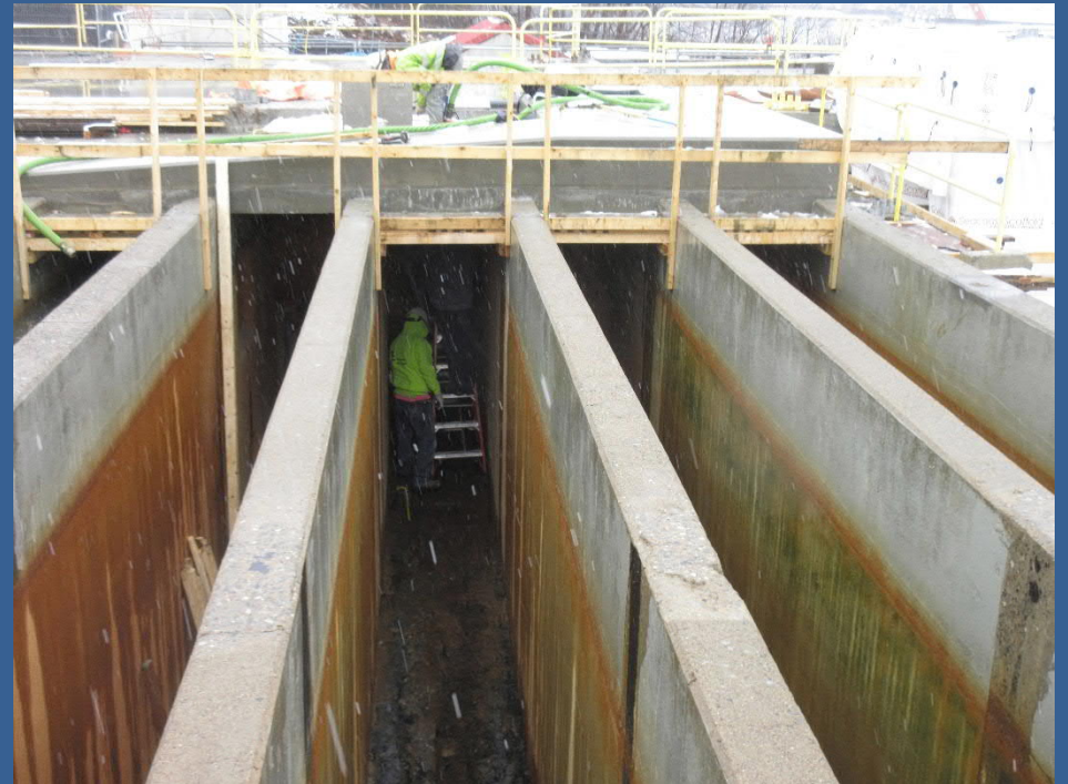
Chlorine Contact Tanks