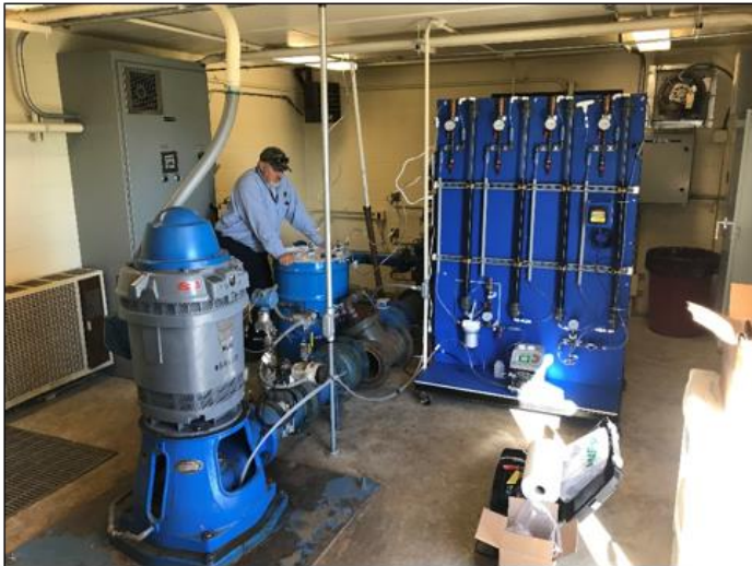
Haven Well Pump